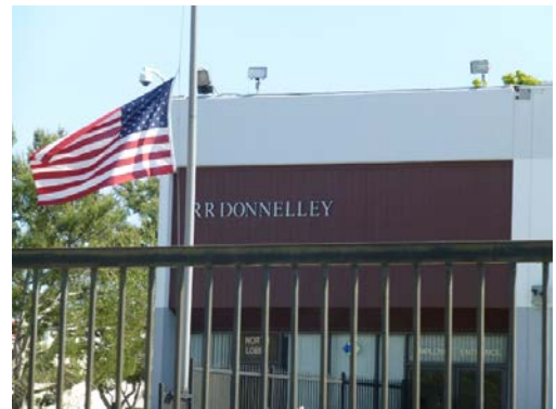
Figure 9: R.R. Donnelley facility

This global integrated communications company provides premedia, printing, logistics and business process outsourcing services. The company operates a branch commercial printing facility at 19681 Pacific Gateway Drive. The facility employs 600 people and contributes an estimated $28 million in annual employment income. The two parcels where the building is located generate $587,000 in property taxes annually. The total assessed value of the two parcels in 2012 was $22.5 million. The facility will include building engineering controls as part of the site remedy. In addition, active remedy components, including chemical oxidation and soil vapor extraction systems, will be located on the property.