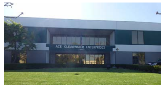
Figure 12: ACE Clearwater Enterprises facility

This woman-owned business builds assemblies for the aerospace and power generation industries. The company’s headquarters is located at 19815 Magellan Drive. The operation employs 100 people and contributes an estimated $6.5 million in annual employment income. The property generates $21,000 in property taxes annually. The assessed value of the property in 2012 was $1.4 million.