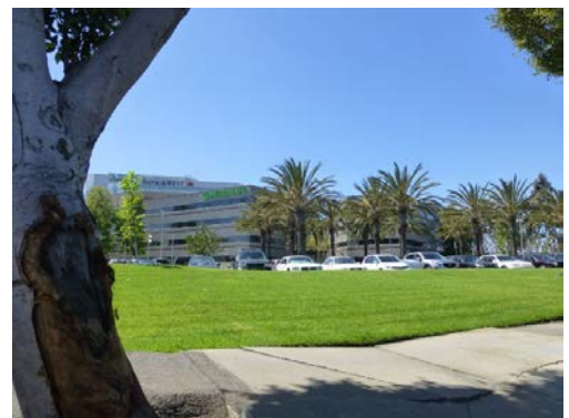
Figure 10: Herbalife building at 950 West 190th Street

This global nutrition company operates in multiple buildings at the site, including a branch office at 950 West 190th Street. Its branch office employs 45 people and contributes an estimated $3.1 million in annual employment income. The assessed value of the building property in 2012 was $26 million. Part of the property will be capped to address soil contamination.