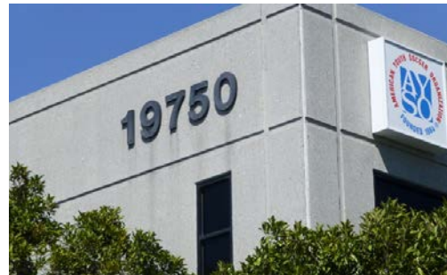
Figure 14: Tenant at the Harbor Business Center

This multi-building business park was built in the early 2000s. Tenants include audio and film companies, freight forwarding and logistic companies, financial advisors and small-scale manufacturers. Together, these businesses employ 155 people and contribute an estimated $11.2 million in annual employment income. The parcels that make up the business park contribute a combined $258,000 in property taxes annually. The combined assessed value of the parcels in 2012 was $19.4 million.