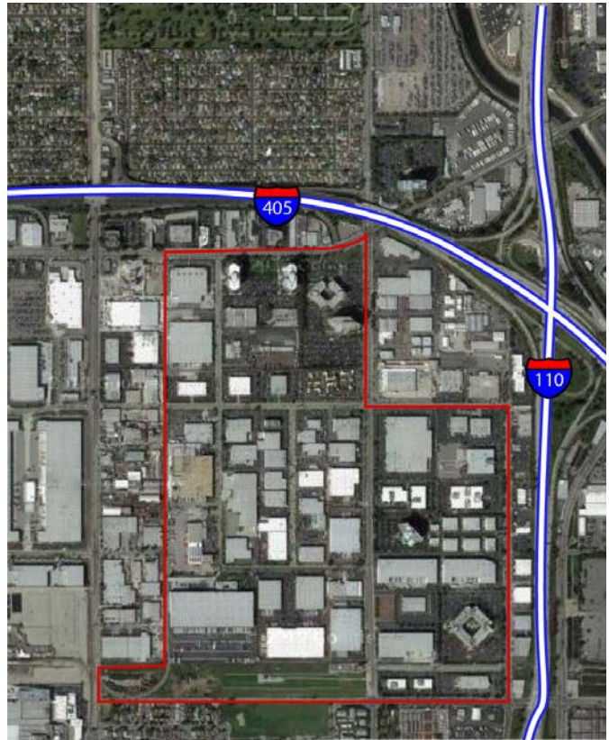
Figure 2: Aerial view of the site

The 280-acre site is located in the Harbor Gateway area of southern Los Angeles. The Harbor Gateway area is a two-mile wide north-south industrial and residential neighborhood. The city acquired the area in 1906 to connect the northern part of the city with the Port of Los Angeles and ocean port cities to the south. The site's surroundings include industrial and commercial areas to the north, east and west and residential areas to the south. West 190th Street borders the site to the north. Del Amo Boulevard borders the site to the south. Hamilton Avenue borders the site to the east. Railroad tracks border the site to the west. There are two major roadways within a block of the site – the San Diego Freeway/Interstate 405 to the north and the Harbor Freeway/Interstate 110 to the east. The Montrose Chemical Corporation Superfund site is located west of the Del Amo site. The two sites are nearly adjacent but contaminated ground water from both sites has merged.