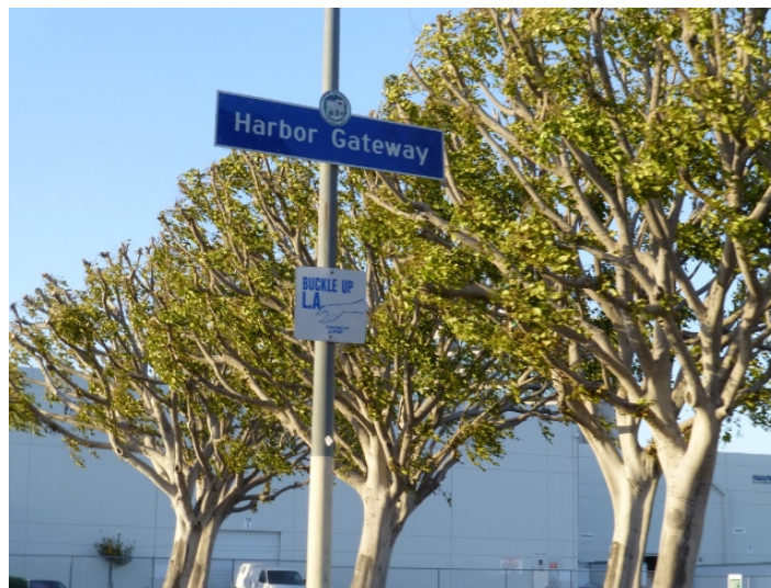
Figure 19: Harbor Gateway sign at the site

In the Harbor Gateway community of Los Angeles, the local government, state agencies, the site's PRPs and EPA came together to develop an innovative system of institutional controls that allow businesses and developers to safely expand or upgrade existing operations, install new infrastructure and build new commercial and industrial buildings on the Del Amo Superfund site. This system has enabled the site to continue serving as the location of a dynamic cluster of diverse businesses while ensuring the protection of human health and the environment. These businesses provide many jobs and substantial employment income for southern California residents and generate tax revenues for state and local government. The site's cleanup and ongoing use illustrate how regulatory agencies and businesses can work together to strengthen communities and advance environmental protection.