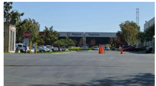
Figure 13: Nippon Express USA facilities on Francisco Street

This transportation services company provides truck services, logistics management, freight forwarding, moving services, customs brokerage, cargo insurance, and warehousing and distribution. It operates in several buildings across the site, including three buildings along Francisco Street. Its facility at 970 Francisco Street employs 50 people and contributes an estimated $2.8 million in annual employment income. The property generates $186,000 in property taxes annually. The assessed value of the property in 2012 was $13 million.