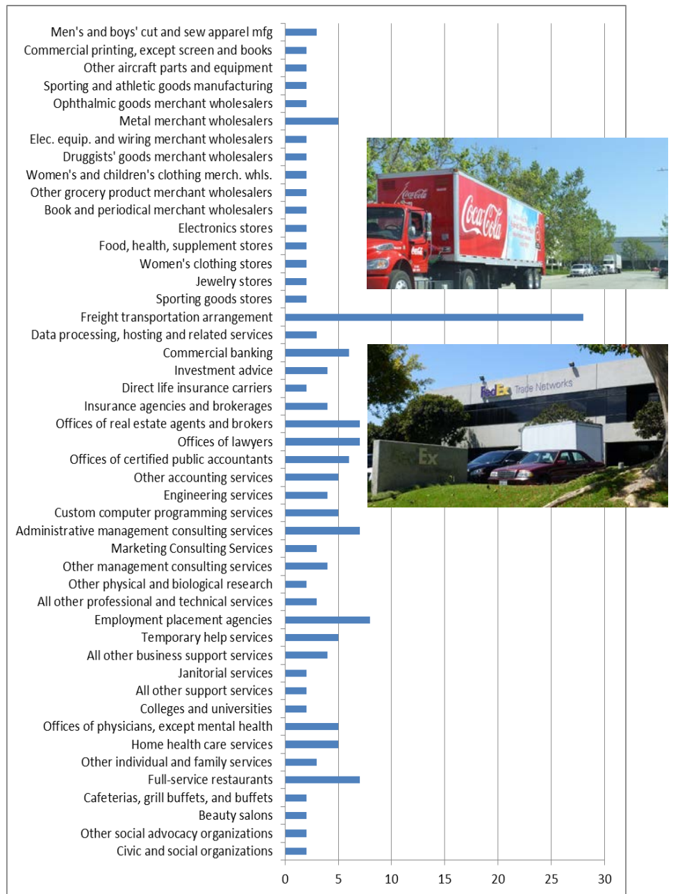
Figure 5: Type of businesses located at the Del Amo Superfund site (minimum two or more businesses)

In 2007, EPA started an institutional control pilot program known as "Building Permit Review." The objective was to involve the Superfund site team (EPA, DTSC and site PRPs) in the City of Los Angeles' building permit process. The site team would work with permit applicants at the site prior to the start of construction projects. EPA was able to work with city departments and permit applicants. EPA was also able to evaluate and adjust protocols, and evaluate this institutional control as part of the Site Soils and NAPL (OU1) cleanup plan. Site PRPs also contracted with a "land-watch" company called Terradex, which monitors site parcels for permit activity or underground service alert information and shares relevant information with EPA. EPA site staff hosted a series of small group and one-on-one meetings and prepared and distributed a fact sheet to inform site property owners about the "Building Permit Review" pilot program.