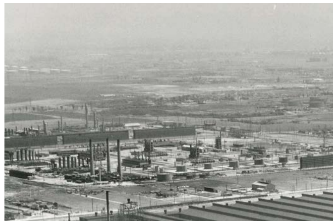
Figure 3: The chemical plant on site before redevelopment

The facility included three main production plants. Workers used several kinds of chemicals to create synthetic rubber. Manufacturing activities resulted in the release of chemicals into soil and ground water beneath the facility. Some of the releases were leaks from pipelines, storage tanks and processing units. Plant operators also disposed of wastes in unlined pits and ponds.