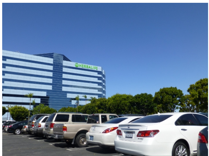
Figure 7: On-site property that underwent environmental review in 2010 for planned construction as part of the site's institutional control program