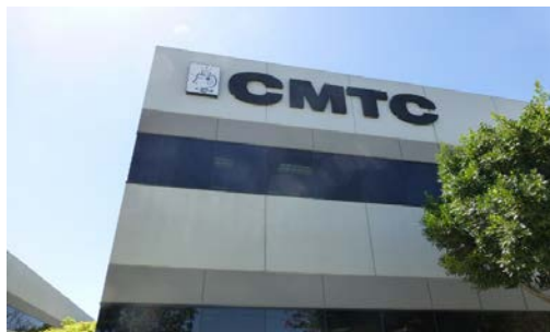
Figure 16: CMTC headquarters