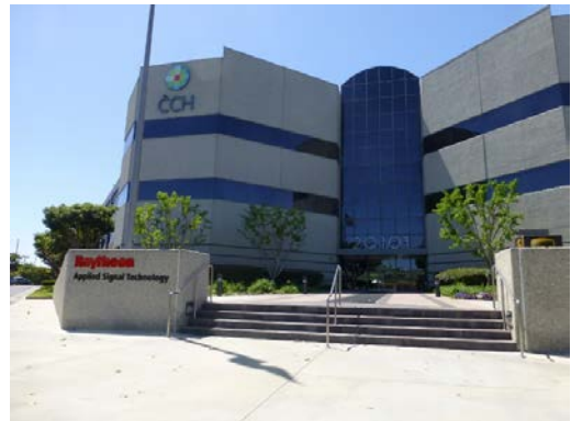
Figure 18: Hamilton Place

This office building at 20101 Hamilton Avenue is home to several tenants, including CCH, a data processing company, and Raytheon Applied Signal Technology, a company specializing in security systems and technologies. Together, businesses on the property employ 399 people and contribute an estimated $33.4 million in annual employment income. The property on which the building is located contributes $561,000 in property taxes annually. The property's assessed value in 2012 was $41.4 million. Active remedy components, including chemical oxidation and soil vapor extraction systems, will be located there. The property sold in November 2012 for $33.7 million.