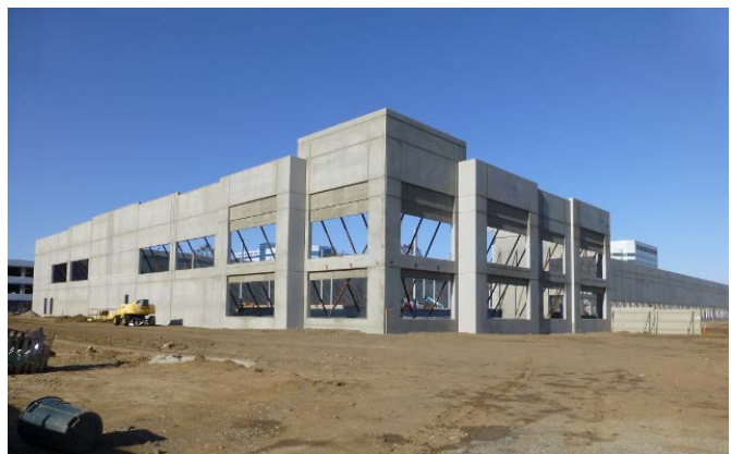
Figure 6: Superfund cleanup followed by redevelopment at the site in 2012-2013