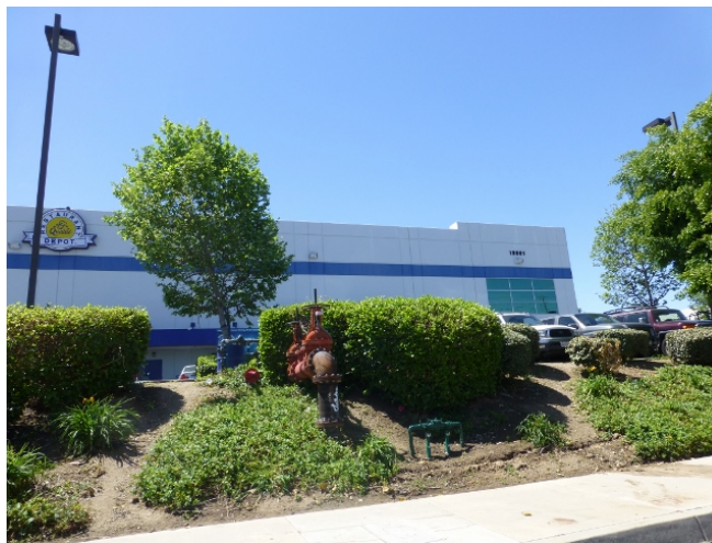
Figure 4: On-site property slated for active remedy components, including a soil vapor extraction system

The 280-acre site includes 82 property parcels. All but about 10 of these acres are now developed for industrial and commercial uses, including light manufacturing, warehousing and offices. According to the Executive Director of the Harbor City/Harbor Gateway Chamber of Commerce Joeann Valle, part of what made the area a desirable location, especially for freight-forwarding companies, is its location next to the 405 and 110 freeways, as well as its location near the Port of Los Angeles, Port of Long Beach and Los Angeles International Airport. In addition, the area is located within a State Enterprise Zone, which provides tax incentives to businesses located there to stimulate business growth and attract new companies, jobs and investment. Although the designation expired in 2009, in May 2012, the state once again designated the area as a State Enterprise Zone. The designation remains in effect until April 30, 2027.