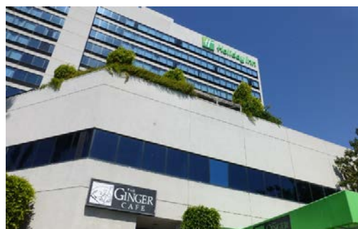
Figure 15: Holiday Inn and restaurant