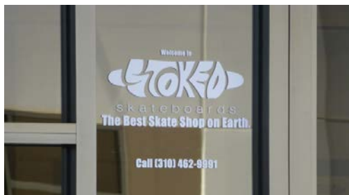
Figure 17: Hamilton Gateway Center tenant sign