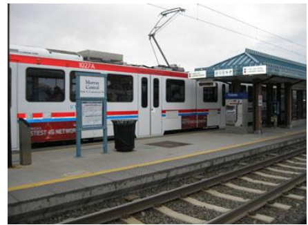
Figure 7: The Murray UTA light rail station

Ash Grove Cement Company's transfer and supply facility occupies the southwest corner of the site – the company manufactures Portland cement and related construction products. The company has operated in its current location for the last 31 years. The site's cleanup approach enabled the business to continue operating throughout the cleanup process. The land value of the property in 2011 was $2.9 million. This company's facility provides two jobs on site and contributes approximately $90,000 in income annually to the community.