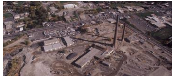
Figure 3: The site prior to cleanup

Formerly owned by the American Smelting and Refining Company (ASARCO), the site included two smelters: the Germania Smelter and Refinery Works, which operated from 1872 to 1902, and the Murray Smelter, which operated from 1902 to 1949. Murray Smelter processed 1,500 tons of lead and silver ore in eight blast furnaces each day. In addition to lead, primary smelting byproducts included slag, arsenic and cadmium.