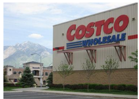
Figure 5: Costco anchors the southeast corner of the site