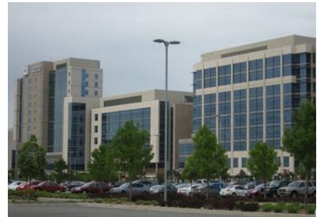
Figure 4: Intermountain Medical Center

When Murray City's police chief looked at the site, he saw a way to provide new training opportunities for local police officers. A multi-function training facility could offer firearms training, classroom space and a fitness center. With the support of local officials and the community, his vision became a reality. The Murray City Police Department's state-of-the-art training center is now located on the northwest corner of the site. In addition to training the city's police force, it also generates revenue from its use by other police departments and area colleges. The property's value in 2011 was $3.1 million.