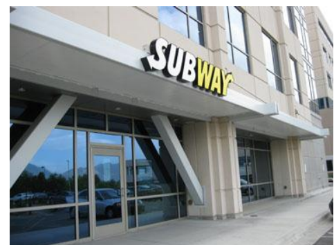
Figure 11: The Subway restaurant located on site