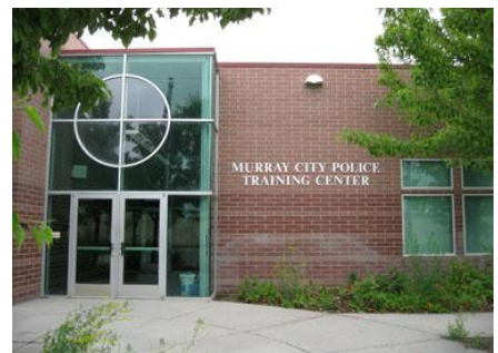
Figure 6: The Murray City Police Training Center