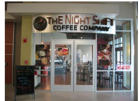
Figure 10: Night Shift Coffee Company