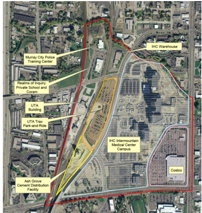
Figure 2: Aerial view of major site reuses

The 142-acre site is located six miles south of Salt Lake City in Murray City, Salt Lake County, Utah (Figure 1). The site is centrally located in the community. Commercial and light industrial land uses border the site, with residential areas and Murray City's downtown district located nearby. According to 2010 Census data, Murray City's population is 46,746.