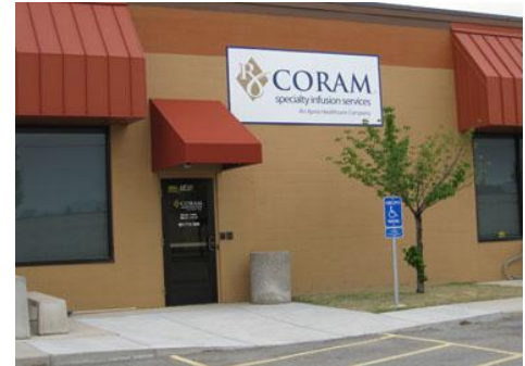
Figure 9: Offices of Coram Specialty Infusion Services

A Subway sandwich shop is now located in the Intermountain Medical Center. The restaurant opened in 2011 and leases its space from building owner IHC. The business provides five jobs on site and contributes approximately $66,800 in annual employment income to the community.