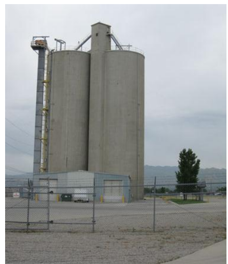
Figure 8: Ash Grove Cement Company