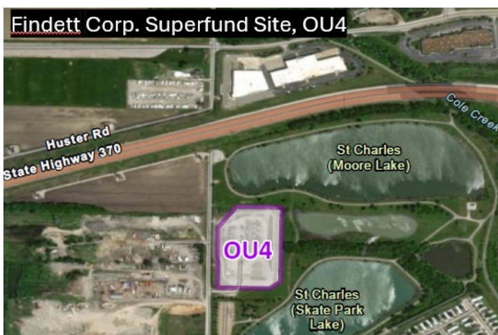
*This OU4 outline represents the location of the Huster Road Substation and is not reflective of offsite contamination