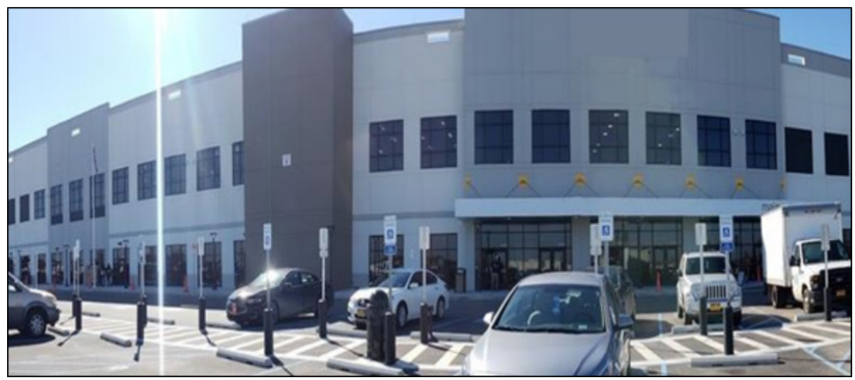
4: Example of what the logistics center could look like after construction is finalized.