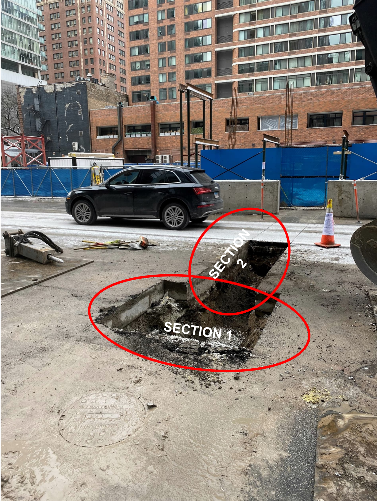
PICTURE 1: NORTH-FACING VIEW OF SECTIONS 1 AND 2 AT 210-225 E. GRAND AVE.