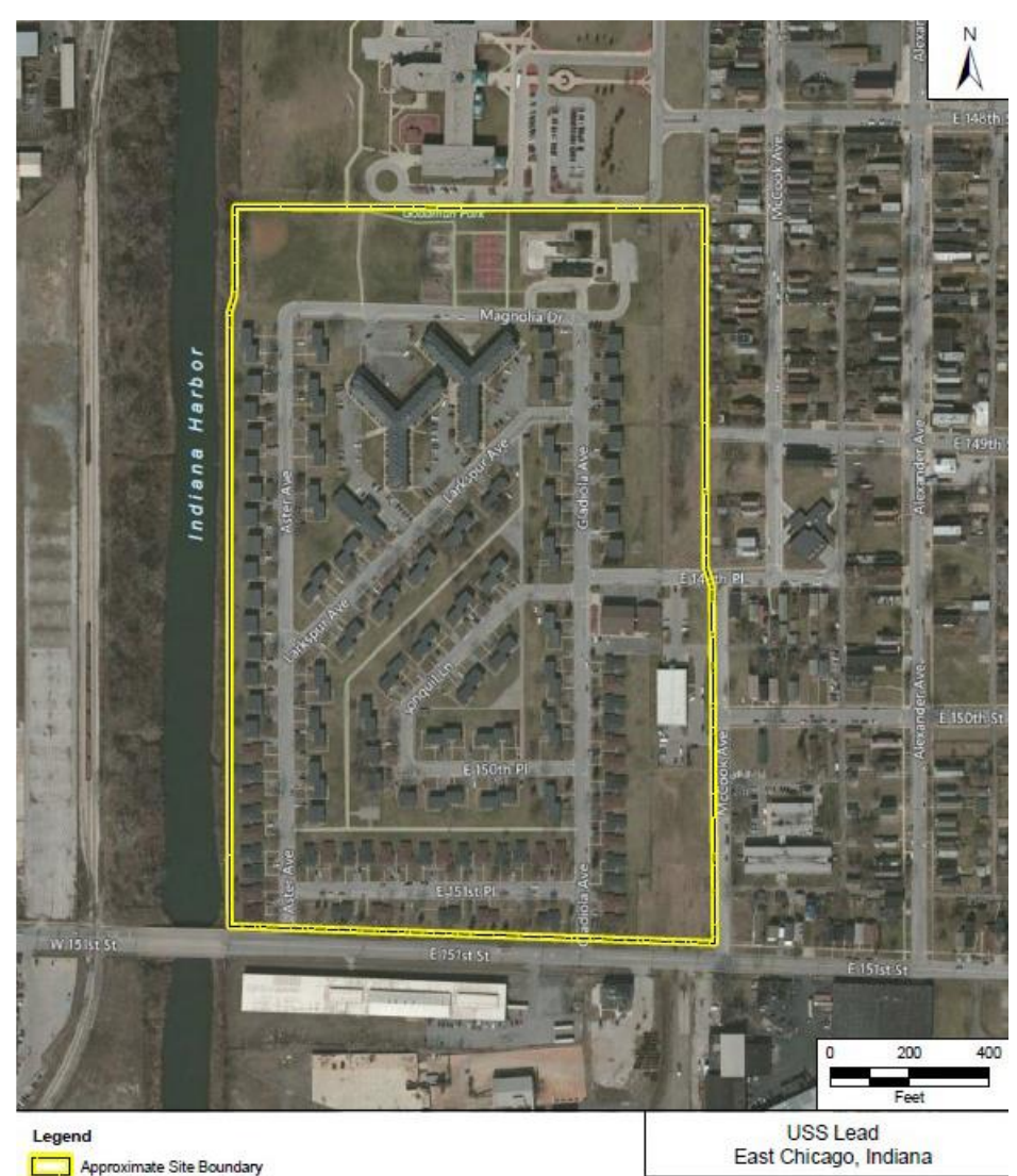
Figure 2: Map of Modified Zone 1

Housing Complex (WCHC). On March 24, 2020, EPA issued the ROD Amendment, which sets forth an amended remedy and a contingent remedy for a modified Zone 1. See Figure 2. What remains of Zone 1 includes the former WCHC and Goodman Park, and the remaining portion of a utility corridor located along the eastern boundary of OU1. For purposes of this document, these three areas will be collectively referred to as "modified Zone 1." EPA refers to this area as "modified Zone 1" because the ROD Amendment modifies the definition of the term "Zone 1" contained in the 2012 ROD. The definition of "Zone 1" in the 2012 ROD consisted of the properties identified above and the Carrie Gosch School. The Carrie Gosch School is governed by the 2012 ROD and not within the area defined as "modified Zone 1" in the ROD Amendment. The cleanup of Carrie Gosch School has been completed by certain potentially responsible parties with EPA oversight.