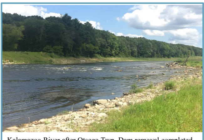
Kalamazoo River after Otsego Twp. Dam removal completed in 2018.