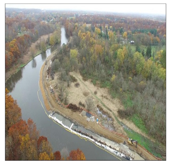
Bank work in Area 3.

EPA, with input from Michigan EGLE and the community, will make the final decision on what cleanup alternative will be implemented. Public comments are important and could encourage EPA to modify or change its preliminary cleanup decision. EPA will review and compile responses to public comments in a document called a responsiveness summary. The final cleanup plan will be published in a document called a "record of decision" or ROD, and available for public review in the site's administrative record. The ROD (which includes the responsiveness summary) and administrative record will be available for review at www.epa.gov/superfund/allied-paper-kalamazoo and at the information repositories shown on page 2.