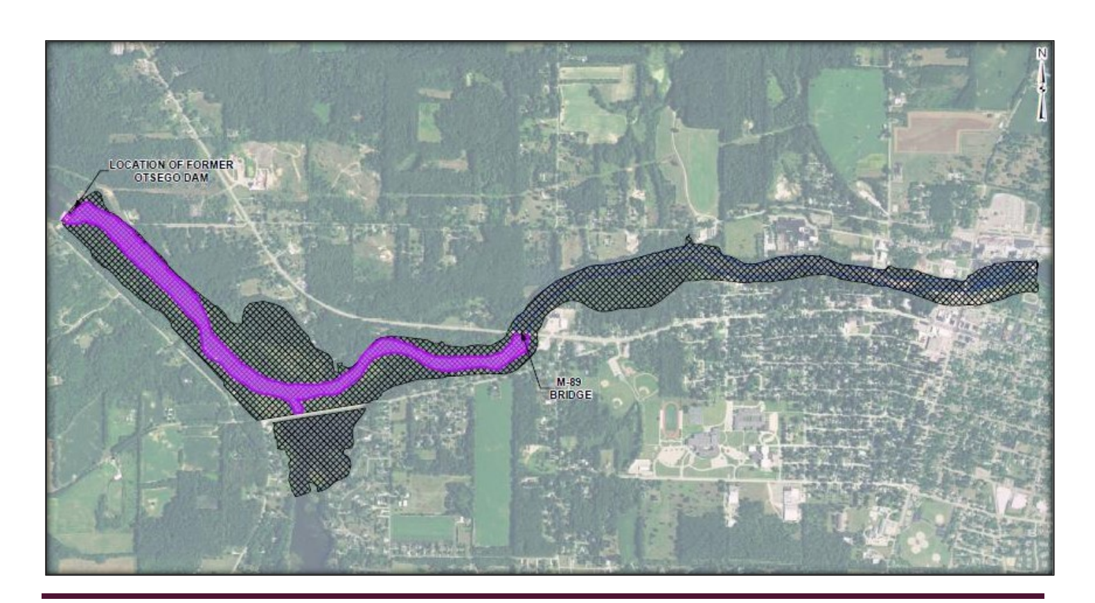
Figure showing area cleaned up by removal action upstream of former Otsego Township Dam, shaded in purple and completed in 2018. Area 3 floodplain areas evaluated for cleanup alternatives shown in grey hashing.