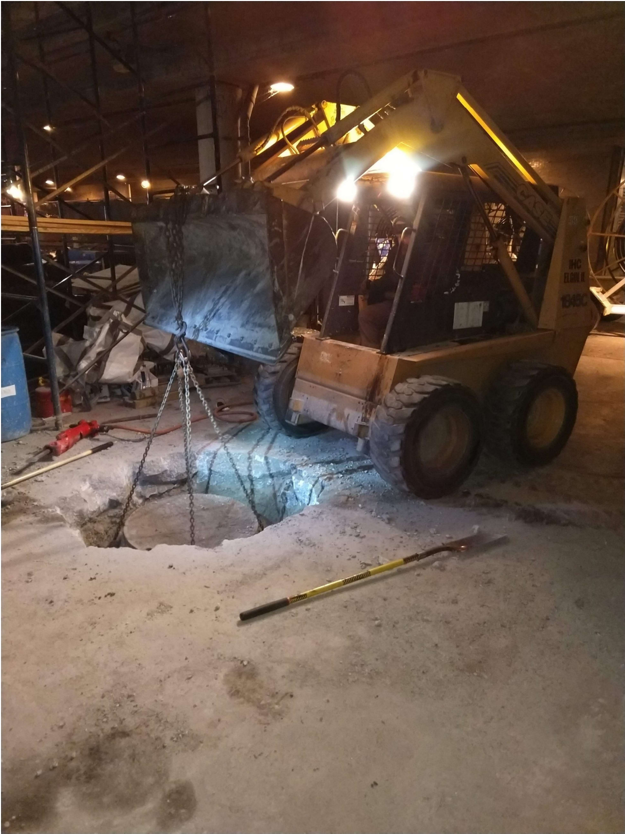
PICTURE 1: VIEW OF THE ALLEY EXCAVATION, LOOKING SOUTH TOWARDS LOWER WACKER PLACE.