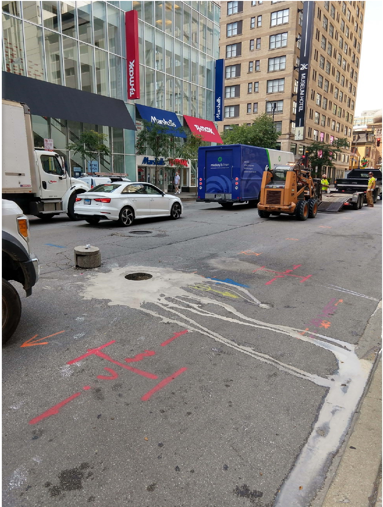
PICTURE 1: VIEW OF THE CORROSION PROTECTION EXCAVATION AT 100 E. ONTARIO ST., LOOKING SOUTHWEST TOWARDS THE INTERSECTION OF ONTARIO AND RUSH ST.