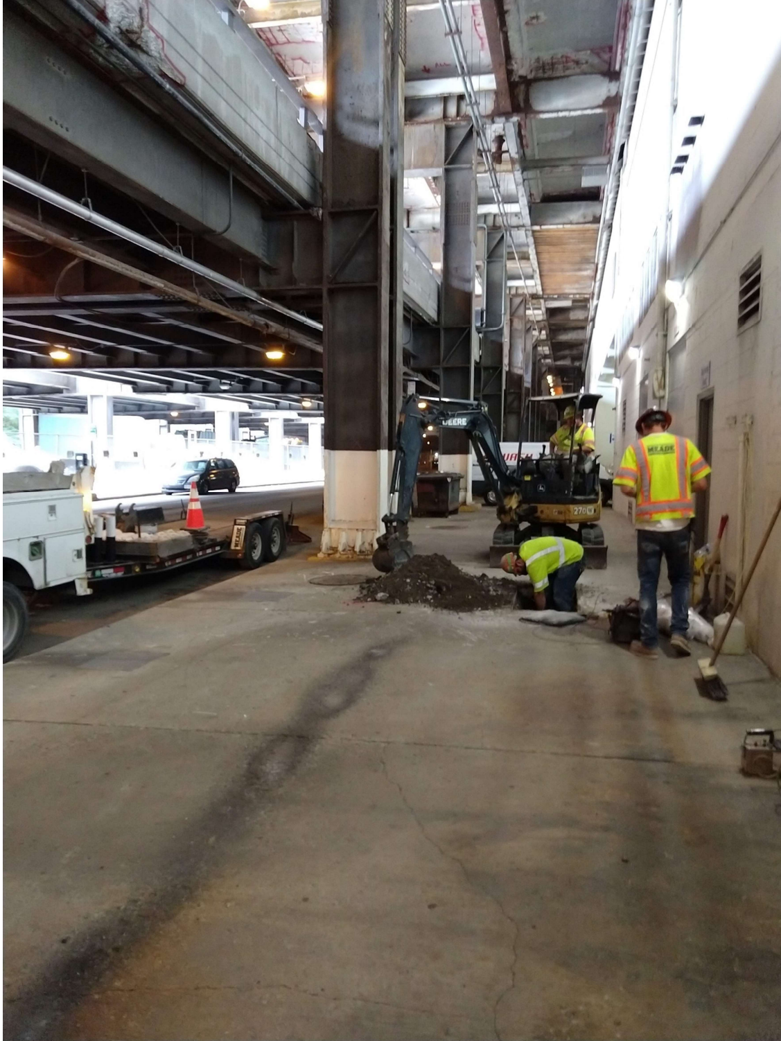
PICTURE 1: VIEW OF THE CORROSION PROTECTION EXCAVATION IN THE LOWER LEVEL OF 400 E. RANDOLPH.