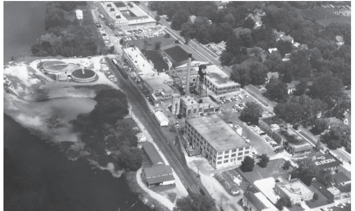
The former Wolverine World Wide tannery operations.

Many of the people we spoke with were very knowledgeable about the former tannery site and had an awareness of the site’s history. Most of the residents have lived in the neighborhood for over 20 years and some of their family members worked at the former tannery. Some of the people interviewed have had some level of involvement with a local neighborhood group formed in response to the Wolverine World