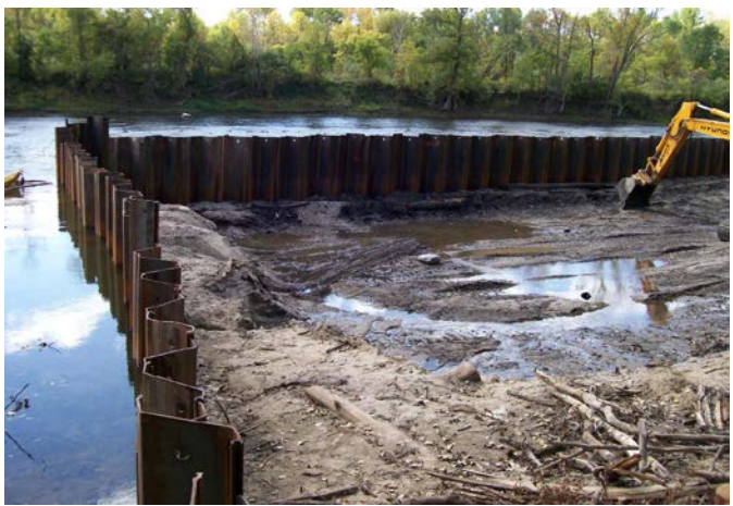
Work crews removing sediment in dry conditions.

BMA cleanup alternatives: There are two alternatives to clean up the BMAs. Here is a brief description of the riverbank soil technologies: