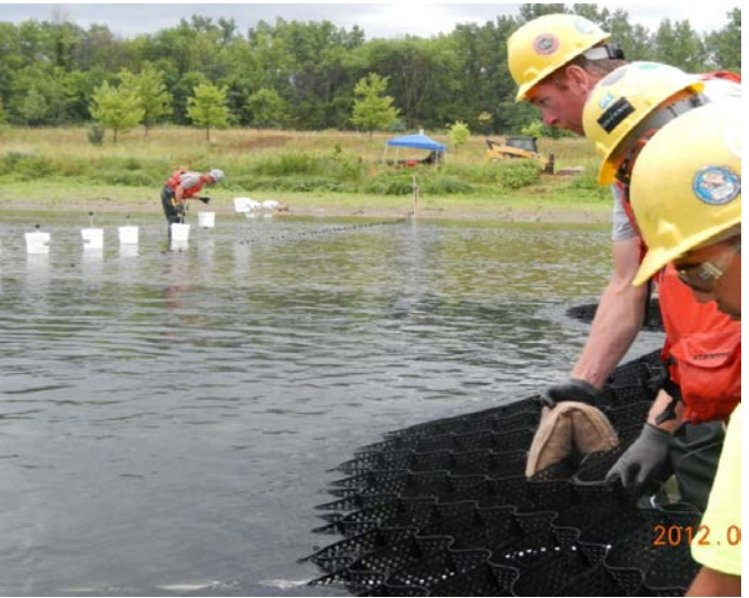
Workers installing a CCS cap.

• Removal involves taking contaminated sediment out of the river with heavy equipment. It can be done in either wet or dry conditions. Water is managed, and the sediment is hauled off-site to an approved location for disposal.