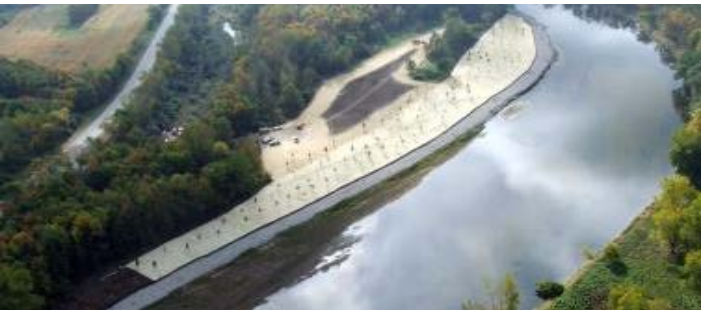
Riverbank removal in 2007; more than 300 mature trees were removed.