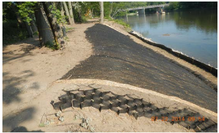
Bank stabilization materials.