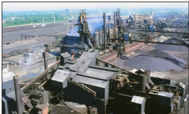
A photograph showing much of the former McLouth Steel Trenton, Mich. plant.

To address environmental issues not covered by the proposed settlement, EPA intends to propose the entire southern portion of the site consisting of approximately 197 acres for listing on the Superfund National Priorities List. Listing on the National Priorities List will make work within the southern portion eligible for federal funding.