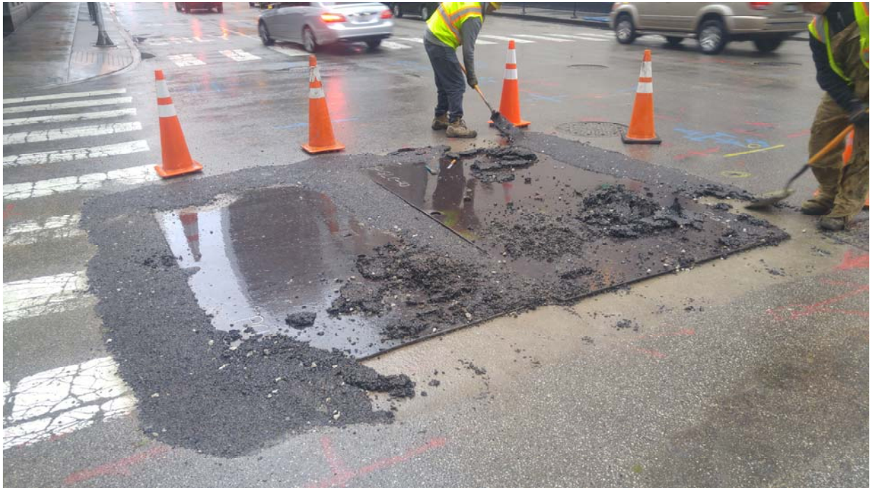
LOOKING EAST DOWN E. OHIO STREET