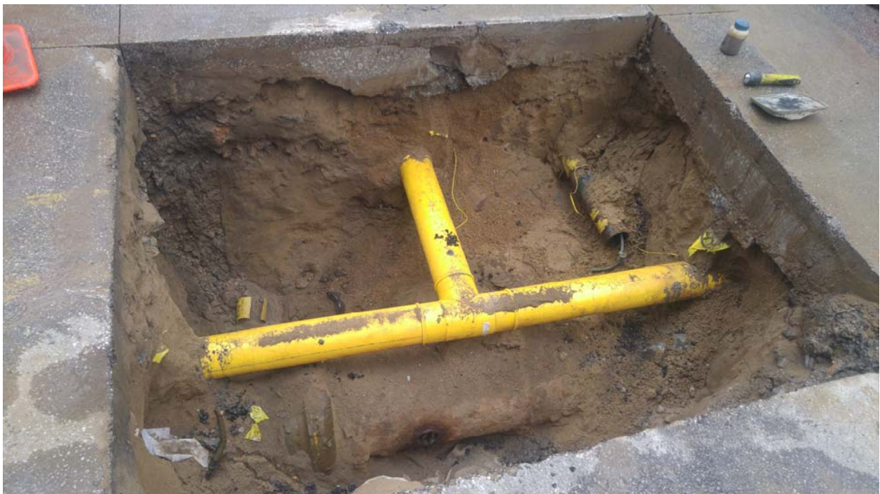
EXPOSED GAS SERVICE LINES