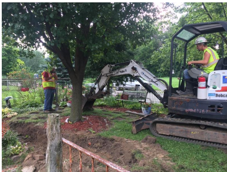
EPA crew excavating residential yard.

EPA removed lead-contaminated soil at 101 properties, including a playground and daycare. EPA dug up the contaminated soil and replaced it with certified clean soil, and restored grass and landscaping. The Agency removed over 25,000 tons of lead-contaminated soil from the Martindale-Brightwood neighborhood. The contaminated earth was transported to a nearby landfill where it can be properly managed.