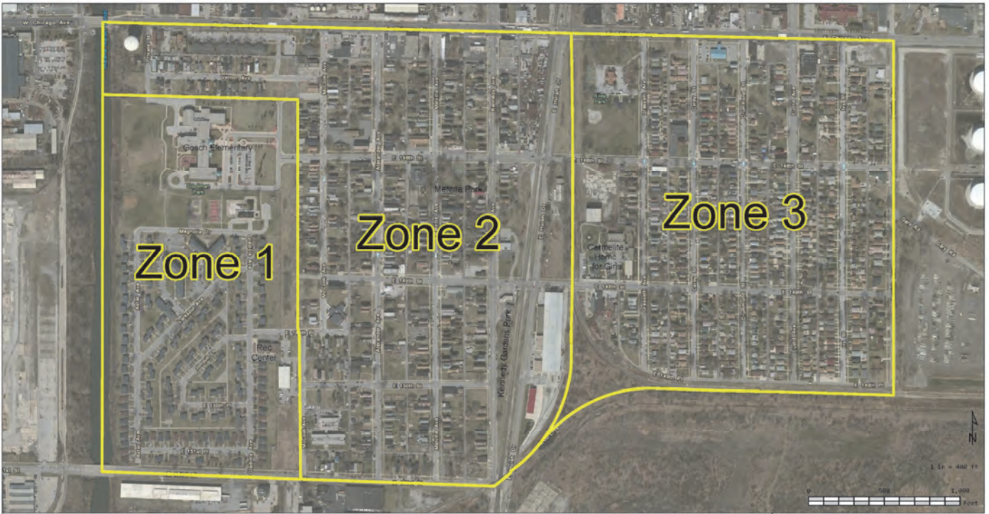
Map showing OUI, the residential area of the site. An agreement has been reached on cleanup work in Zones 1 and 3. Work in Zone 2 will be done under a separate agreement.