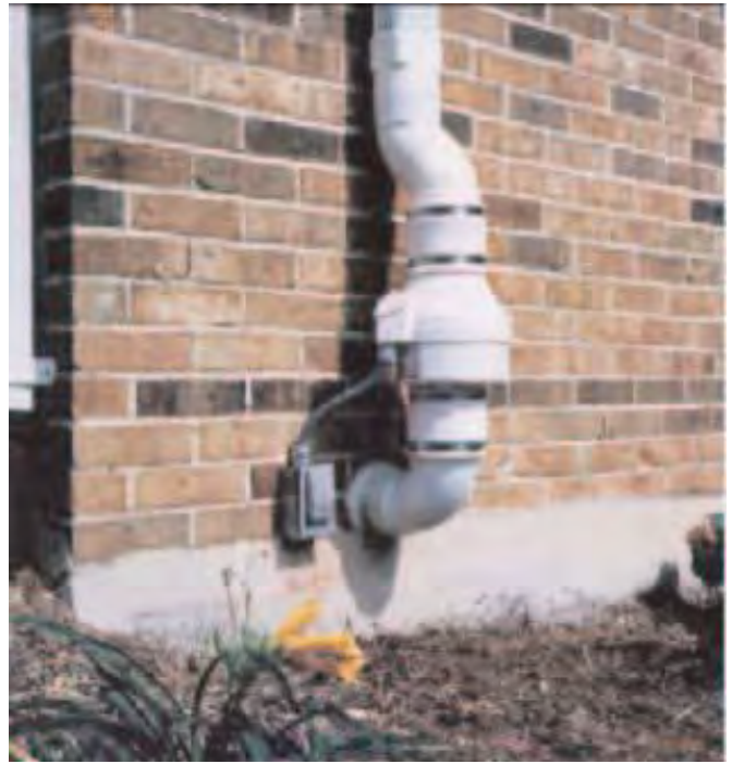
An example of a system that draws radon and other vapors out of the soil and vents them outside. It's known as a “sub-slab mitigation system.”

The results of these samples will tell EPA if indoor air samples are needed. The indoor air samples will tell us if there are vapors in the indoor air. The samples will also show if the vapors pose a health risk, or if they are at levels normally present in most buildings.