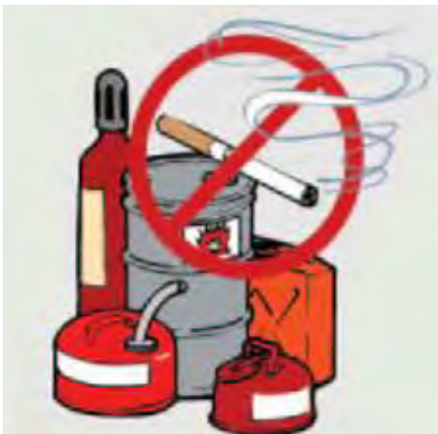
One way to keep harmful vapors out of your home is to make sure common household products, especially chemical- and petroleum-based products, are tightly sealed and properly stored in a well-ventilated area.

Vapors are vented into the outside air where they become dispersed and harmless. These systems use minimal electricity and do not affect heating and cooling efficiency. Once the source of the vapors is eliminated, the systems should no longer be needed.