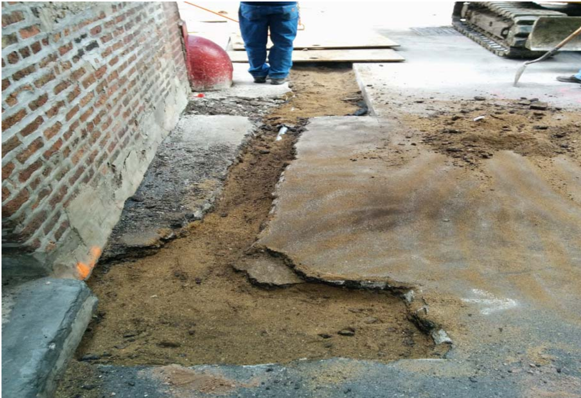
Photograph looking east toward St. Clair Street. Geotextile has been placed in the contaminated portion of trench, conduit installed in trench and a thin layer of sand placed over the geotextile and conduit prior to placement of concrete to complete the installation.