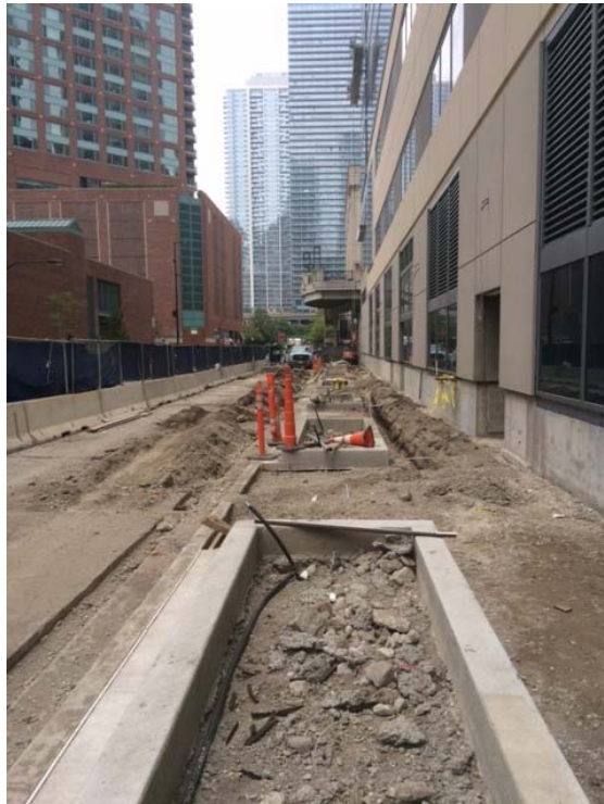
Photo 1 – Looking south along western sidewalk on N. New Street at planters and electrical trench in sidewalk.