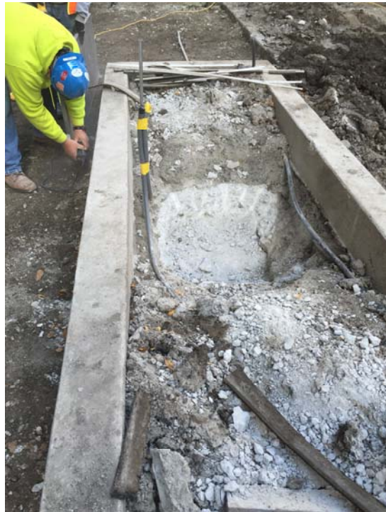
Photo 2 – Tree root-ball excavation for planters located above the concrete slab covering the former slip.