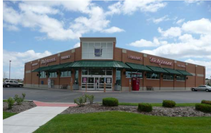
Figure 8: Walgreens is one of the many businesses that opened at Andover Station in the 2000s.

The transformation of the South Andover Superfund site and nearby industrial properties is as impressive as it is important. Once a significant human health and environmental threat, this area is now a thriving retail and commercial center providing jobs, boosting the City of Andover's tax base and supporting revenue generation for the regional transit system. With the assistance of EPA, MPCA and a number of other partners, the site's transformation began in earnest in the late 1980s. Following cleanup work by EPA and the PRP group, city leaders made a courageous decision to assemble the many properties located within and near the South Andover Superfund site. Undaunted by the prospects of dealing with a formerly contaminated Superfund site, the city chose to work directly with MPCA and EPA to carefully address contamination issues. After obtaining the necessary properties, the city funded and oversaw the site planning and preparation necessary to make the area's commercial redevelopment a reality.