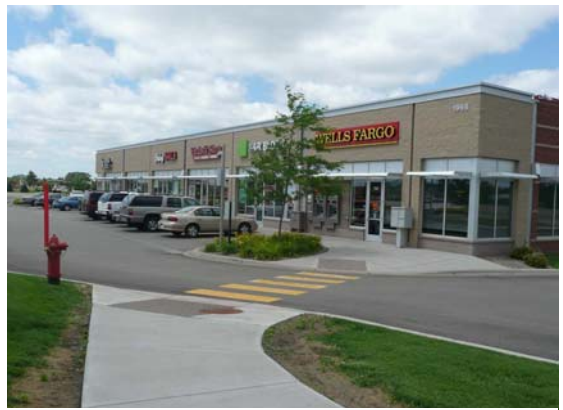
Figure 2: The site is now home to Andover Station, an award-winning pedestrian-oriented retail and commercial center.