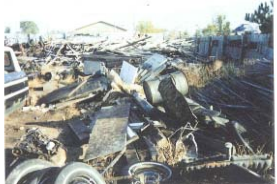
Figure 1: Tires and auto parts littered the site in the 1980s.

Following intensive cleanup efforts, local leadership, land use planning and development have radically changed the site. Commercial shops and offices are now open in the same space that was once covered with scrap tires. Where an estimated 1,000 barrels (most containing dangerous substances) once dotted the landscape, residents from Andover and nearby communities now have access to a Target, a grocery store, a Walgreens drug store, a movie theatre and restaurants. Together these businesses make up a large portion of the redevelopment area known as Andover Station. Viewed as Andover's new downtown, this award-winning, pedestrian-oriented development is attracting shoppers, boosting the local tax base and helping to foster a more walkable and livable community.