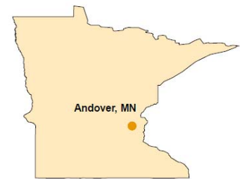
Figure 3: Andover's location in eastern Minnesota.

The South Andover Superfund Site occupies 50 acres near the southern and eastern borders of Andover's city limits. It falls within the 90-acre area now known as Andover Station. This area is surrounded primarily by residential homes. According to 2010 Census data, approximately 3,300 people live in the surrounding census tract.