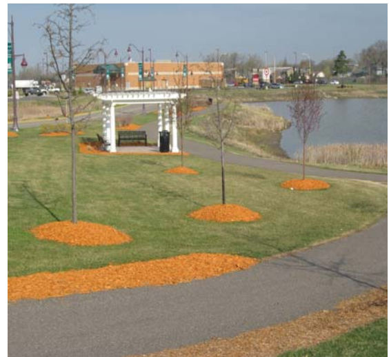
Figure 7: Walkway, open space and sitting area constructed alongside a storm drainage pond at Andover Station. The Target store is visible in the background.