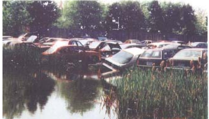
Figure 5: Junkyards on part of the site that would become Andover Station.

Some important issues continued to require additional attention. Investigations in 1997 and 1998 showed a VOC plume underneath the site that had not been identified in earlier studies. EPA, the City of Andover and the PRP group continued to investigate the ground water contamination and in December 2007, the PRP group determined that the overall plume area and its relevant contaminant concentrations had diminished. Although there has been no final resolution of ground water contamination issues, in 2007 the PRP group confirmed that all residences overlaying the plume are connected to municipal water. In addition, all property owners are required to connect to the municipal water before obtaining a Certificate of Occupancy.