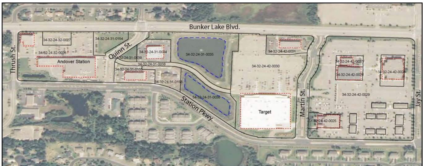
Figure 6: Aerial image of the Andover Station redevelopment area. The area bounded by Thrush Street, Bunker Lake Boulevard, Station Parkway and Jay Street together make up Andover Station, which includes the South Andover Superfund site.

The City of Andover first became interested in redeveloping the site and nearby industrial properties while EPA was conducting site investigation activities in the mid-1980s. The city anticipated that redevelopment of the site and nearby properties could result in a number of economic and environmental benefits. The city took out bonds to pay for additional site cleanup and established a tax increment finance (TIF) district encompassing the South Andover Superfund site and nearby properties to help pay off the bonds. In 1996 and 1997, the city acquired each of the parcels comprising the site and the nearby properties, mostly through eminent domain. Collectively these properties, totaling 90 acres, would come to be known as Andover Station.