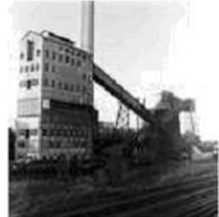
Figure 1: The Koppers Industries, Inc. facility, 1969

A legacy of contamination left vacant nearly 40 acres of valuable property in Saint Paul, Minnesota. Once the site of a foundry coke production facility, the property was located next to major industrial and commercial development and transportation infrastructure, which spurred the Saint Paul Port Authority to clean it up for redevelopment. As a result of the Port Authority's vision, part of Energy Park, a thriving commercial development, now stands on the Koppers Coke Superfund site. The site's characteristics, creative planning, and the cooperation of public and private stakeholders contributed to this redevelopment success story. Today, businesses at Energy Park employ over 3,800 people; businesses on the Koppers Coke site portion of the development employ 1,667 people and contribute $1.6 million in local property taxes. This case study explores the local economic revitalization resulting from the cleanup and redevelopment of this Superfund site.