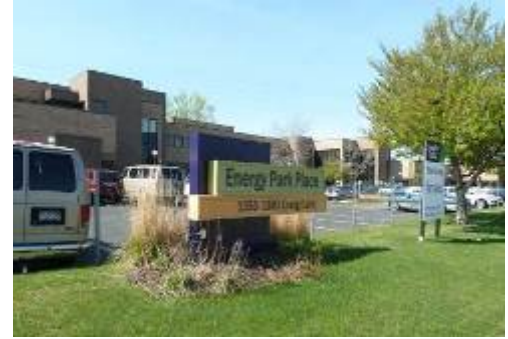
Figure 5. Energy Park Place sign

With testing centers in 163 countries, Prometric provides technology-enabled testing and assessment services for academic, professional, healthcare, government, corporate and information technology clients. 4 At its offices in Energy Park Corporate Center, Prometric employs 89 people, providing estimated annual employment income of $5.3 million.