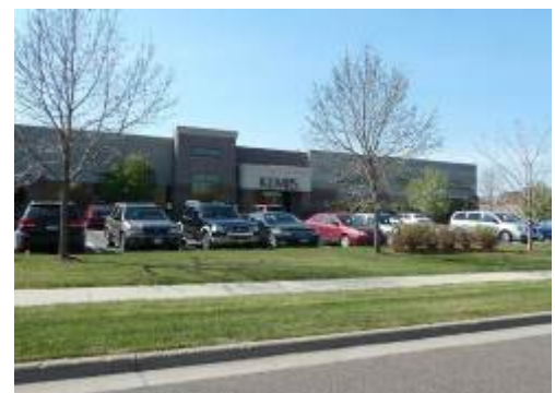
Figure 6. Kemps facility at Energy Park Corporate Center