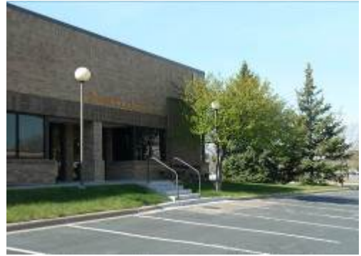
Figure 8. Offices of Minnesota Bureau of Mediation Services at Energy Park Place

This state program provides support for regulated health care professionals whose ability to practice may be impaired due to illness. The program employs five staff at its offices in Energy Park Place, providing estimated annual employment income of $350,000.