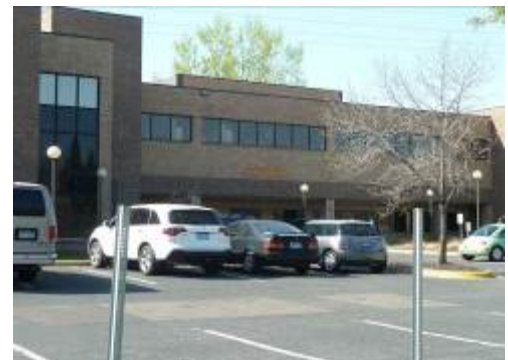
Figure 7. Offices at Energy Park Place