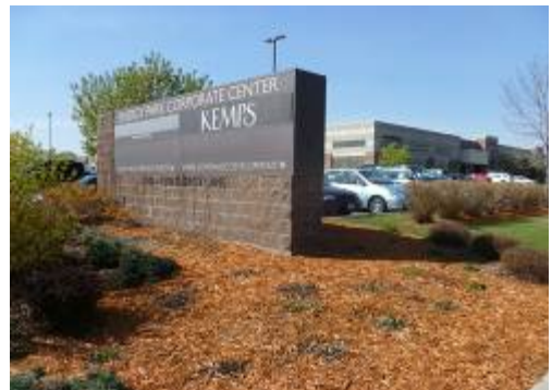
Figure 10. Energy Park Corporate Center sign