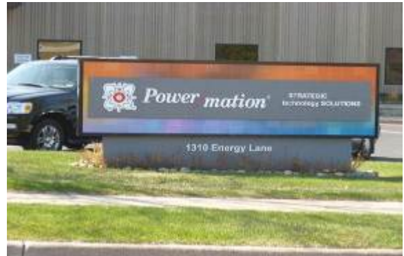
Figure 4. Energy Park tenant Power/mation's facility on site

Energy Park occupies 218 acres in Saint Paul, Minnesota; the Koppers Coke site is a 40-acre part of the facility. Energy Park is situated northwest of downtown Saint Paul, one mile north of Interstate 94 and about three miles west of Interstate 35 (Figure 2). According to 2010 Census data, about 285,000 people live in Saint Paul.