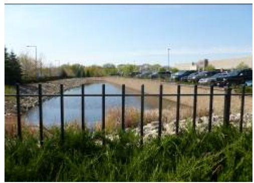
Figure 9. Stormwater management pond at Energy Park Corporate Center