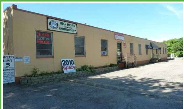
Figure 4: Buildings in the 2010 East Hennepin Complex