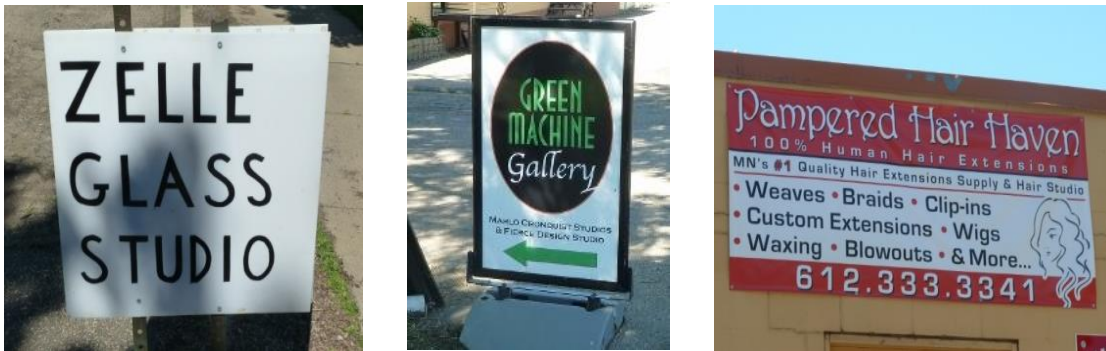
Figure 7: More businesses found at 2010 East Hennepin Avenue

the arts and add to the cultural vitality of the area. The businesses also provide local residents with jobs and employment income, and generate sales tax revenue that supports state and local governments. Following the sale of the property in 2012, current site owner First & First LLC, a real estate company, remains committed to the property's reuse. MPCA and General Mills continue to work with the owner to ensure the protection of human health and the environment and enable small businesses to continue to thrive at 2010 East Hennepin Avenue.