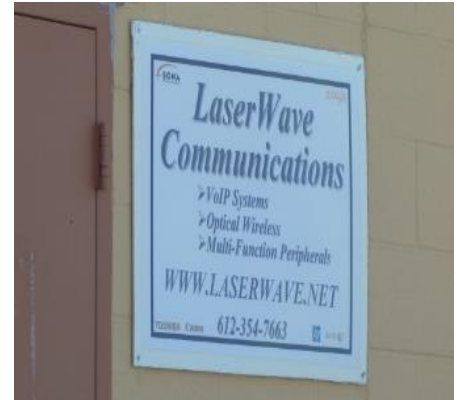
Figure 5: Businesses operating at 2010 East Hennepin