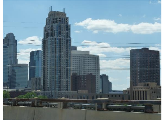
Figure 2: Downtown Minneapolis

The 7-acre site is located at 2010 East Hennepin Avenue in northeast Minneapolis, Minnesota. Neighborhoods along with light industrial and commercial areas surround the site. Downtown Minneapolis and the Mississippi River are about 2.5 miles to the west.