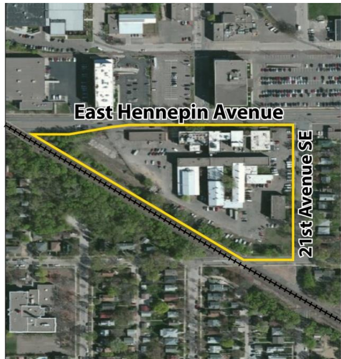
Figure 3: Aerial view of the site

Once the ground water treatment system was in place, the site could safely support reuse. After the Henkel Corporation put the property on the market, it eventually sold at auction to B.B.D. Holdings, a real estate investment group, around 1990. B.B.D. Holdings could have torn down on-