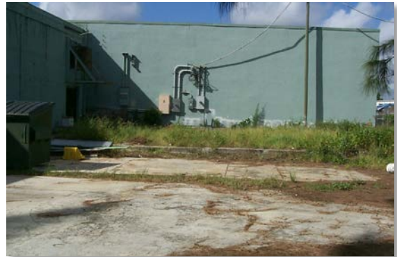
Figure 2. Former location of the wastewater pond at the Trans Circuits, Inc. site.

While BMI-Textron and Trans Circuits, Inc. are separate sites, they share a similar industrial history. Basic Microelectronics, Inc. (BMI) began manufacturing operations in Lake Park in 1969. Textron Inc. acquired BMI in January 1981 and began operating at the site as BMI- Textron. The business made chromium-backed glass plates used in the production of electronic components. Liquid waste containing cyanide was disposed of through percolation ponds and drain fields, resulting in the contamination of soil and ground water with arsenic, sodium, cyanide and fluoride. The business closed in early 1986.