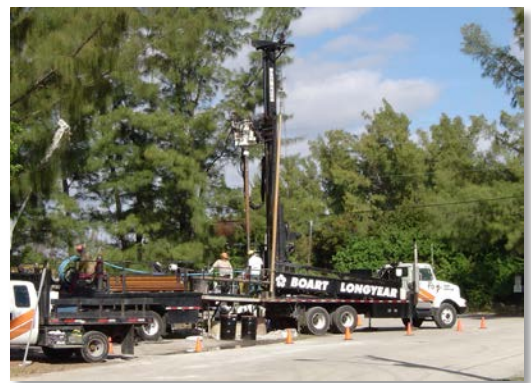
Figure 3. Replacement of the public water supply well at the Trans Circuits, Inc. site.

After placing the site on the NPL in 2000, EPA began investigating the site and evaluating cleanup options. Over time, high demand for developable land in the area began to draw attention to the property for its reuse potential. In an area with limited land available for commercial and industrial development, the site's location in an established business park made it attractive to developers and business owners looking for expansion opportunities. The National Land Company purchased the site in 2000. EPA developed a Prospective Purchaser Agreement (PPA) and a Covenant Not to Sue to address the company's liability concerns. The covenant states that owners will use the property appropriately, in ways that ensure the protectiveness of the remedy. With these documents in place, the stage was set for redevelopment. The site was first home to Concept Eco, Inc., a marketer of recycled-content clothing and other products. The company started leasing the existing building on the site property in 2001 and purchased it in mid-2004.