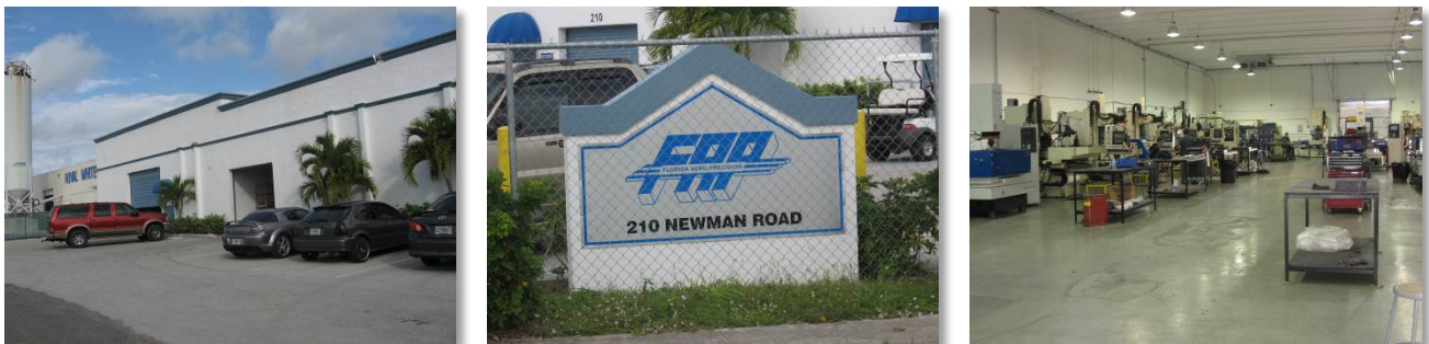
Figure 5. Florida Aero Precision operations at the Trans Circuits, Inc. site.

Today, at both sites, Florida Aero Precision manufactures turbine components that are used internationally. The company emphasizes environmentally responsible practices, recycling metals, water and oils. The company also uses environmentally friendly coolants and relies on waste-to-energy incineration to dispose of waste liquids. Additionally, business operations remain protective of the remedies in place at both sites. At the Trans Circuits, Inc. site, the company complies with land use restrictions in the site's cleanup plan. Florida Aero Precision has agreed to not install wells on the property without permission from EPA, not allow residential development of the area and not engage in any activities that could interfere with the remedy. The company also allows EPA regular access to the site for ground water monitoring and treatment. At the BMI-Textron site, an asphalt cap covers a small area of contaminated soil left in place. Florida Aero Precision also complies with ground water restrictions required by the remedy.