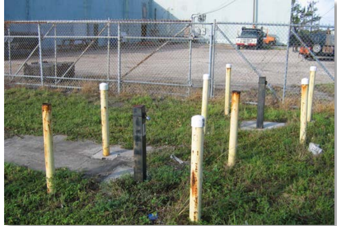
Figure 4. Monitoring wells at the Trans Circuits, Inc. site.

With these documents in place, and questions and concerns addressed, Florida Aero Precision purchased the property in late 2011. EPA and stakeholder cooperation not only addressed stakeholders' liability concerns, but