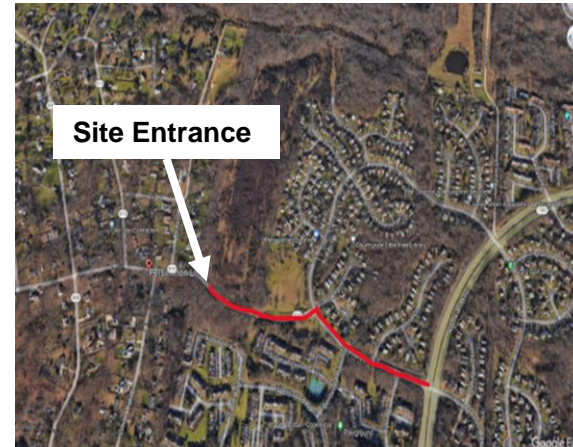
Truck Route to/from Site