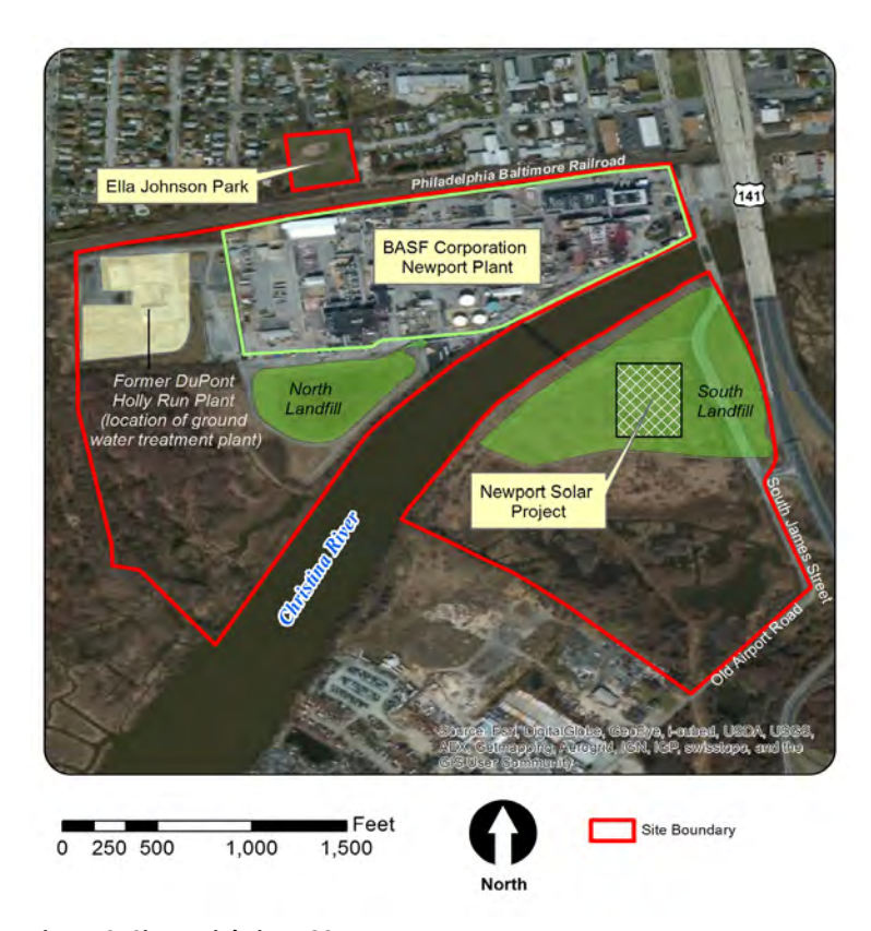
Figure 2. Site aerial view, 2014.

Chromium dioxide production expanded in the 1970s with construction of the Holly Run Plant. Ciba-Geigy Corporation (later Ciba Specialty Chemicals Company) purchased the main pigment manufacturing facility in 1984. DuPont continued to operate the Holly Run Plant, manufacturing chromium dioxide magnetic recording tape until 2000. BASF Corporation purchased the pigment manufacturing facility in 2009. It continues to operate the facility today. DuPont retains