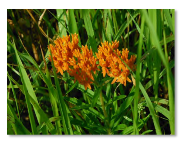
Figure 3. Butterflyweed ( Asclepias tuberosa ) planted as part of DuPont's ecological restoration program.

The paint pigment manufacturing facility occupies only part of the 120-acre site. After completing most of the cleanup, DuPont researched productive ways to use vacant areas of the site. With restrictions in place across much of the site to prevent damage to landfill caps and sensitive wetland areas, DuPont had to choose carefully which projects to implement. As a company that values sustainability, DuPont was especially interested in identifying projects that would reduce greenhouse gas emissions, foster renewable energy technologies to power clean economies, and protect ecosystems.