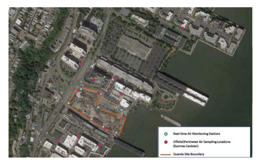
Air Monitoring/Sampling Locations

The Quanta property was the home of a roofing tar plant for more than 100 years. Roofing tar was produced from coal tar, a dark-colored viscous liquid which contains naphthalene, which smells of asphalt or mothballs. Cleanup work at the Quanta site includes mixing cement into contaminated soil (a process called solidification) to permanently lock up heavy metals, coal tar, and waste oils so these contaminants cannot move. Some naphthalene vapors are likely when soil containing coal tar is disturbed. These vapors can also linger after construction workers have left the site.