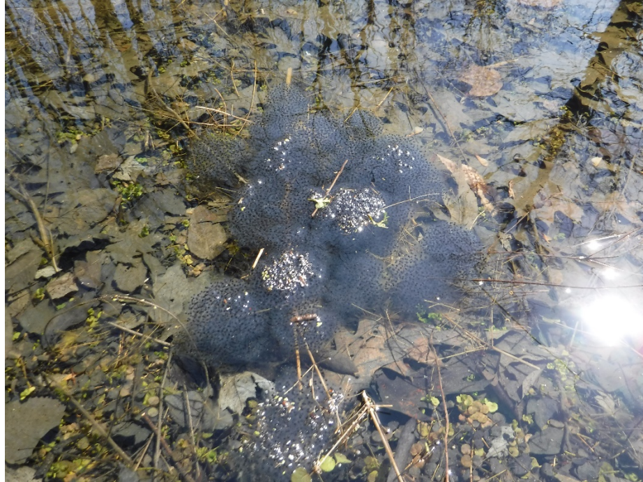
Photo 3. Wood frog egg masses along the 4C vernal pool eastern shoreline. Bluestone. March 26, 2020.

Reference: 2020 Phase 4C Floodplain Vernal Pool Survey — GE-Pittsfield/Housatonic River Site, Pittsfield, Massachusetts