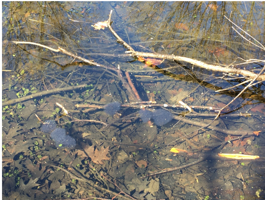
Photo 2. Approximately six wood frog egg masses observed at the 4C vernal pool. BEAT. March 22, 2020