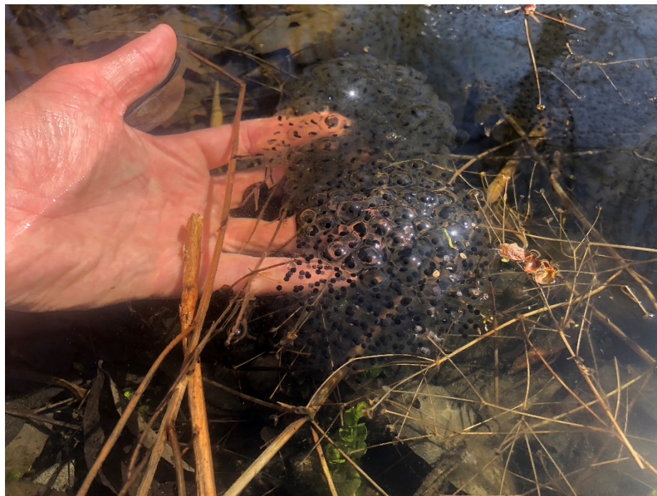
Photo 6. Wood frog egg masses at the western edge of Vernal Pool 4C. April 6, 2020.