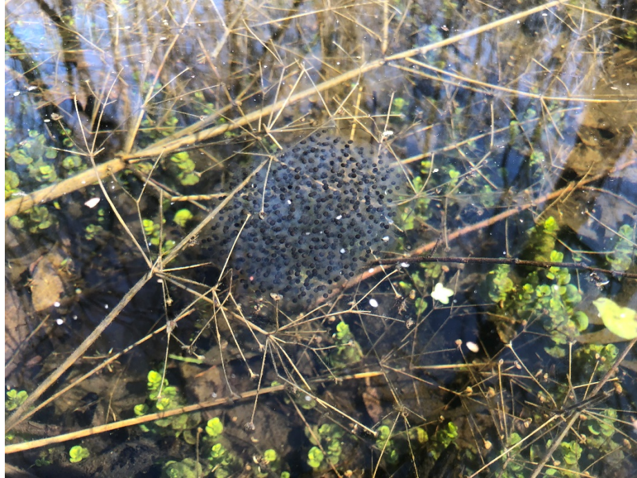
Photo 7. Single wood frog egg mass near the center of Vernal Pool 4C. Stantec. April 6, 2020.

Reference: 2020 Phase 4C Floodplain Vernal Pool Survey — GE-Pittsfield/Housatonic River Site, Pittsfield, Massachusetts