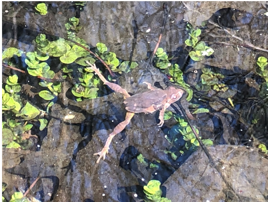
Photo 8. Spring peepers in breeding amplexus in the south end of Vernal Pool 4C. Stantec. April 6, 2020.