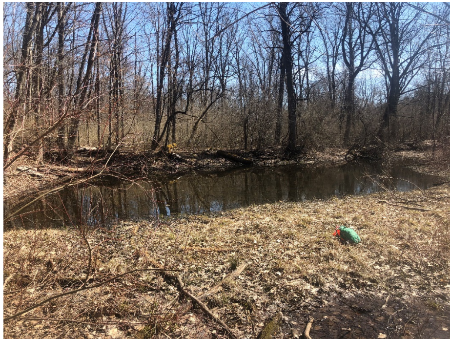
Photo 4. Vernal Pool 4C looking southeast from the northwest shoreline. Stantec. April 6, 2020.