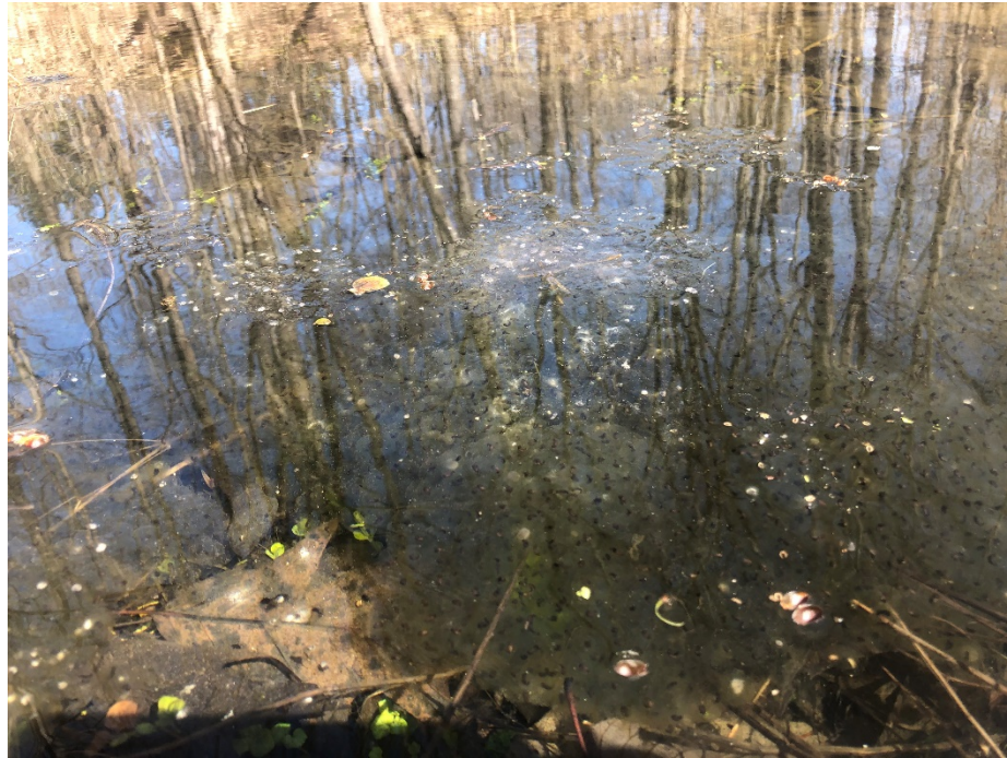
Photo 5. A raft of wood frog egg masses at the western edge of Vernal Pool 4C. Stantec. April 6, 2020.

Reference: 2020 Phase 4C Floodplain Vernal Pool Survey — GE-Pittsfield/Housatonic River Site, Pittsfield, Massachusetts