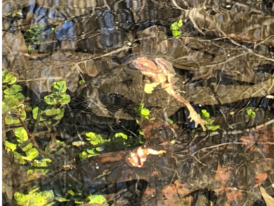
Photo 9. Spring peepers in breeding amplexus in the south end of Vernal Pool 4C. Stantec. April 6, 2020.

Reference: 2020 Phase 4C Floodplain Vernal Pool Survey — GE-Pittsfield/Housatonic River Site, Pittsfield, Massachusetts