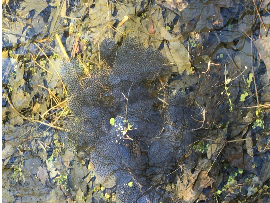
Photo 1. Approximately 25 wood frog egg masses observed at the 4C vernal pool. BEAT. March 22, 2020.

Reference: 2020 Phase 4C Floodplain Vernal Pool Survey — GE-Pittsfield/Housatonic River Site, Pittsfield, Massachusetts