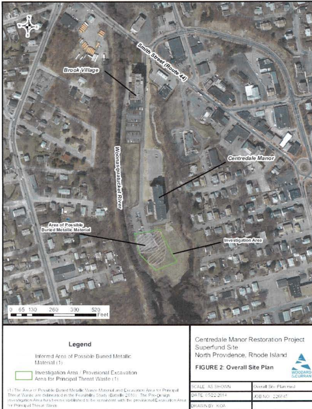
Figure 2. PDI Investigation Area