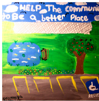
Four of the 400 site murals created by neighborhood children as part of the Project GROW public art initiative

The reuse planning process also sparked broader interest in the future use of the site, with several developers contacting EPA, the City of Houston, and the site’s bankruptcy trustee, the court-appointed entity responsible for managing the MDI company’s assets. Given the interest in the site, the U.S. bankruptcy court determined in late 2003 that it would be sold at auction.