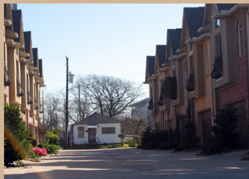
The site's surroundings (from top to bottom): roadway east of the site; electric utility and former community school west of the site; view of downtown from nearby Swiney Park; and old and new housing adjacent to each other in the Fifth Ward