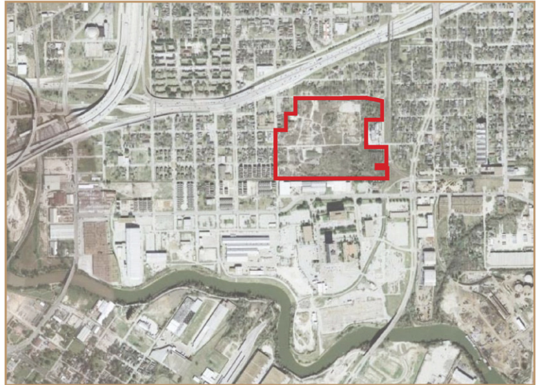
MDI Superfund site (OU1), Houston, Texas