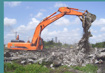
Removal of concrete and site debris as part of cleanup activities, 2007

2008+: Infrastructure installation and site redevelopment