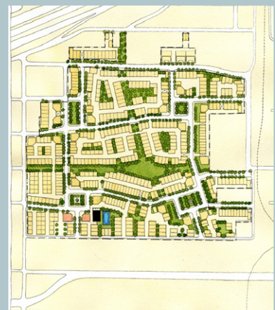
DPZ's conceptual residential reuse plans for the site