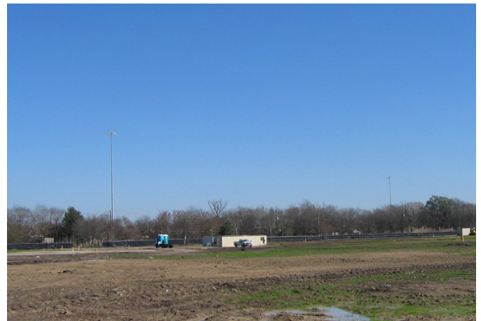
View of the MDI site looking north following cleanup, 2008

In March 2005, several months after EPA provided the draft Agreed Order to the site’s bankruptcy trustee, the 36-acre MDI site property was sold at auction. Clinton-Gregg Investments acquired the site for a bid valued at $7.8 million – an agreement to clean up the site at a cost estimated by EPA to be $6.6 million and a cash payment of $1.2 million for the bankruptcy trustee and administrative costs.