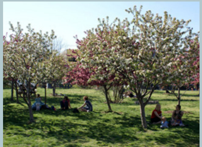
After: Liberty Lands community park.

Neighborhood residents led the way in transforming the area into an urban garden and community park, addressing significant obstacles and finding resources to make Liberty Lands a reality. Initial reuse plans for the area had called for loft housing; when the development did not move forward, the developer donated the site property to the Northern Liberties Neighborhood Association (NLNA) in 1995, based on the neighborhood's interest. The NLNA worked with the City of Philadelphia to remove a $500,000 lien that had been attached to the property, and received a $60,000 grant from the Pennsylvania Urban Resources Partnership Program in 1997 to support the park's development. EPA provided soil testing and other technical assistance to ensure that the site was safe for reuse as a park and community garden.