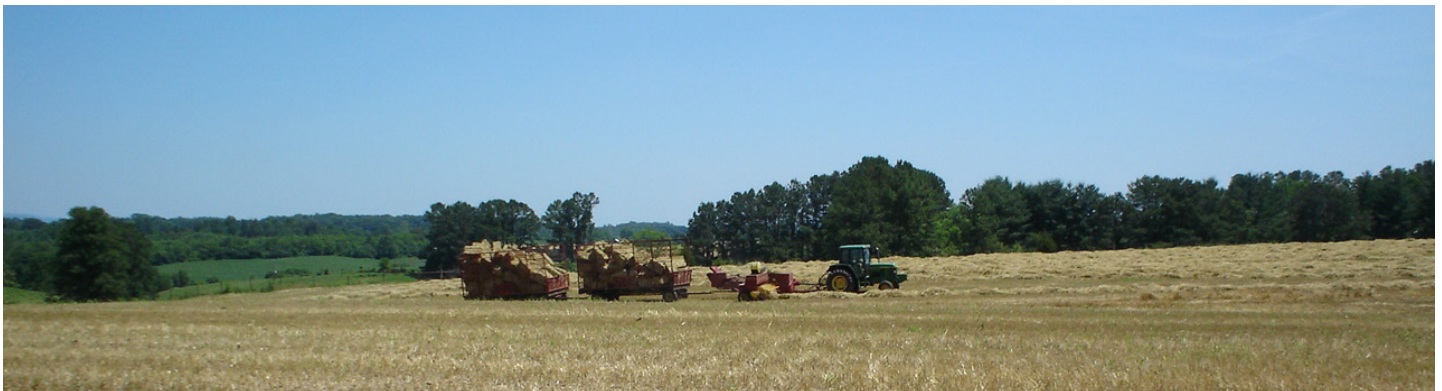
According to USDA, more than a billion acres of land in the United States are dedicated to growing crops and livestock production. As of 2011, there are over 550 Superfund sites in actual or planned use, including more than 210 sites in agricultural, ecological or recreational uses.