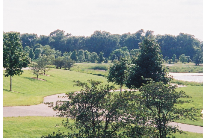
The Petersen Sand & Gravel Superfund site in Libertyville, Illinois, is now part of the 1,100-acre Independence Grove Forest Preserve.

Sustainably managed forest areas can be harvested for timber over the long term, generating significant revenues. In some cases, sustainably managed forests can also generate revenues through the mitigation of greenhouse gases, by sequestering carbon dioxide (CO 2 ) to address climate change. Biological carbon sequestration occurs as trees and plants store CO 2 in their roots, bark and leaves. Forest management can provide