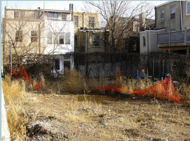
Before: The neighborhood prior to cleanup.

Twenty years ago, the Northern Liberties neighborhood was the only zip code in Philadelphia without a community green space. The neighborhood was the location of several tanneries until 1986; operations led to the area's contamination with pesticides, PCBs and metals. EPA conducted removal actions and cleaned up the area. In 1987, EPA removed 750 drums, hundreds of laboratory chemical containers, 23 sludge containers and crushed drums. EPA followed up in 1990 to clean up spilled PCBs.