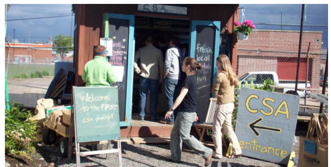
In 2011, there are approximately 1,500 CSA programs nationwide.

Two farms on formerly contaminated areas in Philadelphia highlight that urban sites can also be well-suited to agricultural reuse, building on the burgeoning national interest in community food systems. Urban Superfund sites are often located in close proximity to large numbers of people, as well as lower-income neighborhoods with limited access to fresh produce. These sites are large enough to support viable urban farms and available infrastructure can reduce start-up costs. Finally, the revitalization of these formerly vacant, stigmatized properties can help foster and sustain neighborhood revitalization efforts, replacing areas of community concern with local amenities.