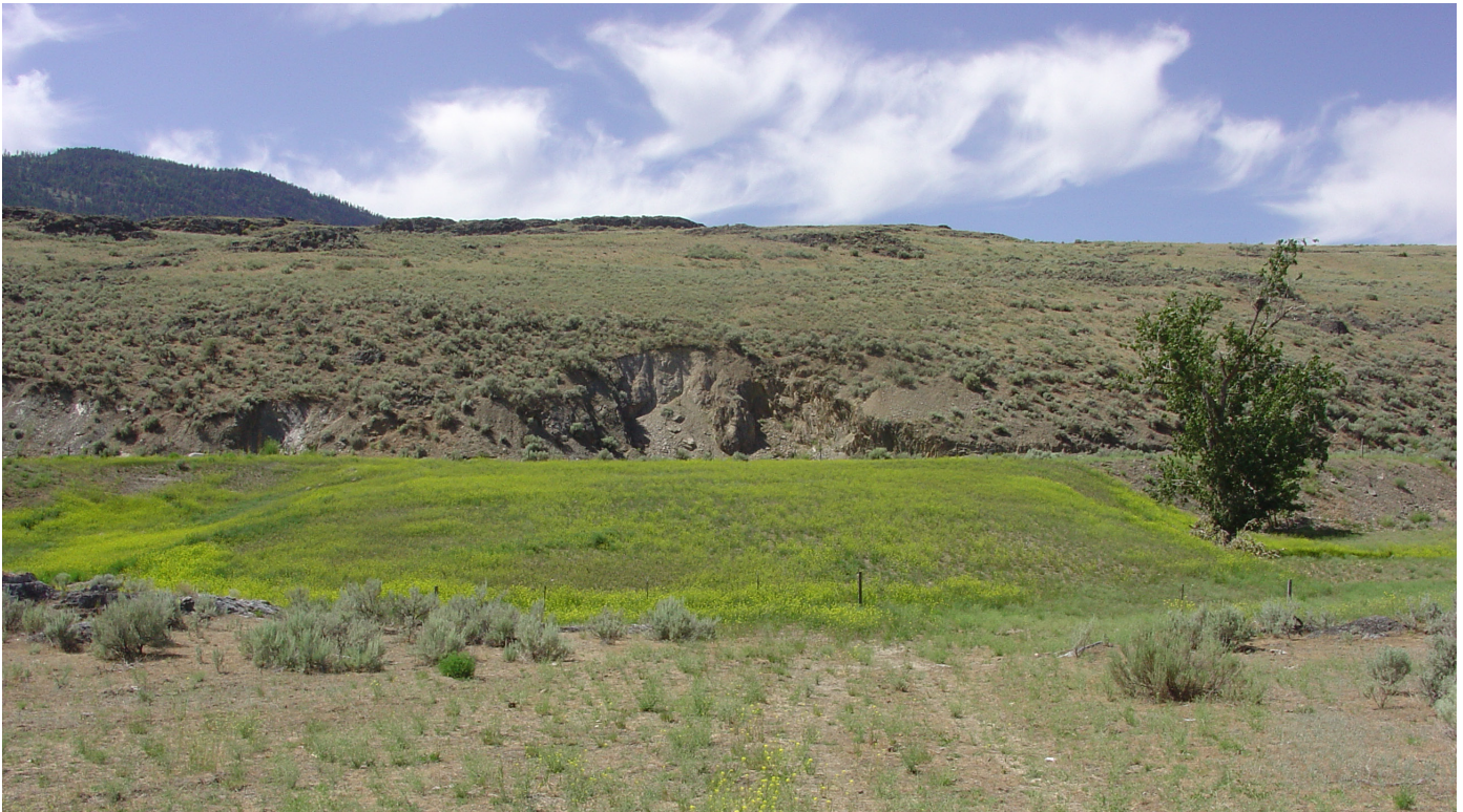
At the Silver Mountain Mine site in Loomis, Washington, cattle have been grazing across most of the 5-acre site for more than a decade.