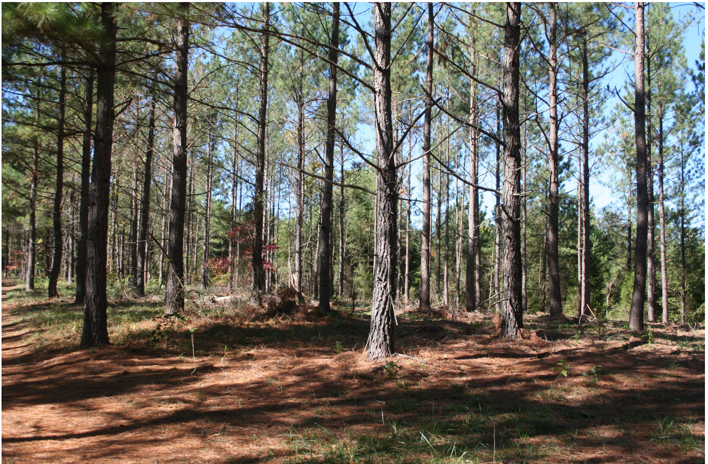
In addition to being harvested for timber and mitigating greenhouse gases, sustainably managed forest areas can also help clean up Superfund sites.

a significant opportunity to reduce CO 2 levels. Finally, forest management can also serve as a part of cleanup remedies at Superfund sites – phytoremediation techniques rely on plants and trees to remove contaminants from site soils.