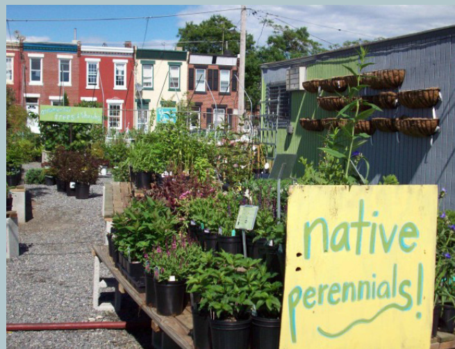
Plants for sale at Greensgrow Farm, an urban agriculture project located on a former Superfund site in Philadelphia, Pennsylvania.

Greensgrow Farm began with small-scale operations, expanding its offerings as the company's neighborhood and restaurant client profile became more established. The company's lettuce was all hydroponically grown in