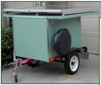
Portable electricity generators equipped with photovoltaic panels and batteries can be used to power investigative equipment such as chilling or heating units.

Procurement of goods and services offers other opportunities for conserving natural resources: