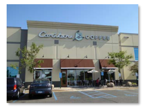
Figure 6: Caribou Coffee's on site retail location.

A distributor of landscaping products and services, MTI Distributing is a wholly owned subsidiary of Toro Company, which produces landscape maintenance and irrigation equipment.<sup>3</sup> MTI Distributing's corporate offices are located in Building #2 at Twin Lakes Business Park, contributing over $5.6 million in annual employment income. In addition, the firm uses a steep hill that was constructed as part of the cleanup action to test landscaping equipment and pays property taxes on that land as well.