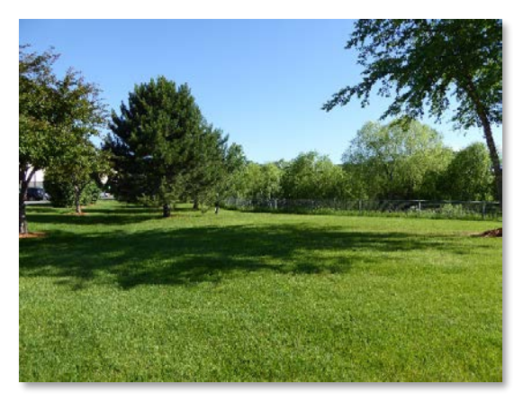
Figure 3: Green areas around storm water retention ponds.

Joslyn Manufacturing ceased wood-treating operations at the site in 1980 and removed process solutions from the site, disposing of them at a hazardous waste facility in 1981. In 1983, MPCA issued a Request for Response Action to the company, asking that it undertake cleanup to address the release of hazardous substances at the site. EPA listed the site on the Superfund program's National Priorities List (NPL) in 1984; through an agreement with EPA, MPCA continued to oversee the site's cleanup. Site cleanup began in 1988 with activities that included the excavation, treatment and disposal of contaminated soil in a hazardous waste landfill. Additional contaminated soils were treated and disposed of on site. The company installed a pump-and-treat system to clean up site groundwater in 1989. After the company finished these activities in 1996, it placed a fence around the property to protect the remedy.