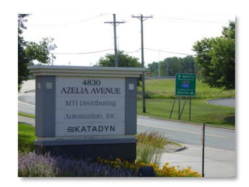
Figure 8: Business directory sign for businesses in Phase I and II.