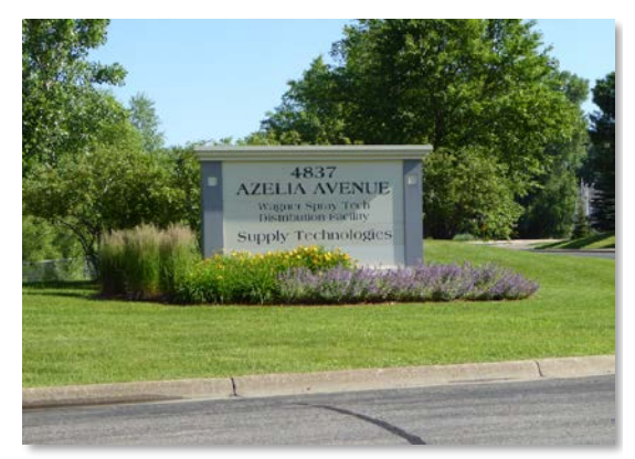
Figure 5: Business park directory for Phase 1 of redevelopment.

It was the development of the Twin Lakes Business Park that allowed the development of the fourth phase. Once prospective tenants had seen that it was possible to redevelop a formerly contaminated area, it became much easier to market these facilities as viable development opportunities. Prospective developers had previously looked past the area due to the stigma of a contaminated site, but once they had seen the results, this fourth phase had no trouble finding tenants. Currently, the facility's tenants include FujiFilm and Omnicare of Minnesota. Fujifilm manufactures camera equipment, while Omnicare is a pharmaceutical wholesaler. Together, these businesses employ about 200 people, providing nearly $24 million in annual employee income with annual sales close to $29 million. The parcel associated with the fourth phase has a present market value of $4.8 million and contributes about $211,000 in annual property tax revenues to the local government.