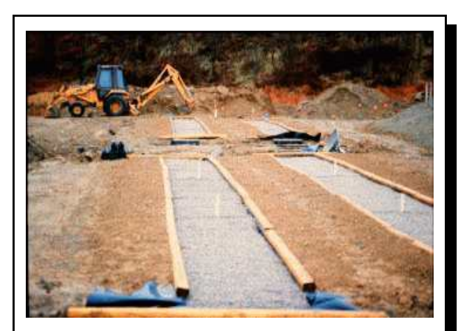
Powell River Project Wetland Construction

As a compensatory mitigation approach, wetland banking provides certain ecological benefits that other compensatory mitigation methods do not. Because the wetlands at a bank must be monitored and fully functional in advance of development that adversely affect wetlands, wetland banking is more likely to successfully offset the damaged wetland functioning than mitigation occurring after the damage has taken place. Additionally, the wetland bank's existence and proven functionality prior to a developer's need for its credits eliminates the temporal