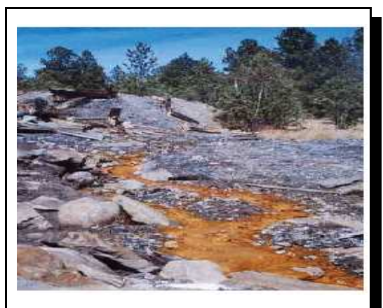
Acid mine drainage at Minnesota Ridge, Black Hills, South Dakota.

Former mine lands continue to cause water quality problems because they are a major source of heavy metal pollutants. Mining often requires deforestation