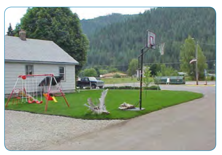
Get your property sampled at no cost to you