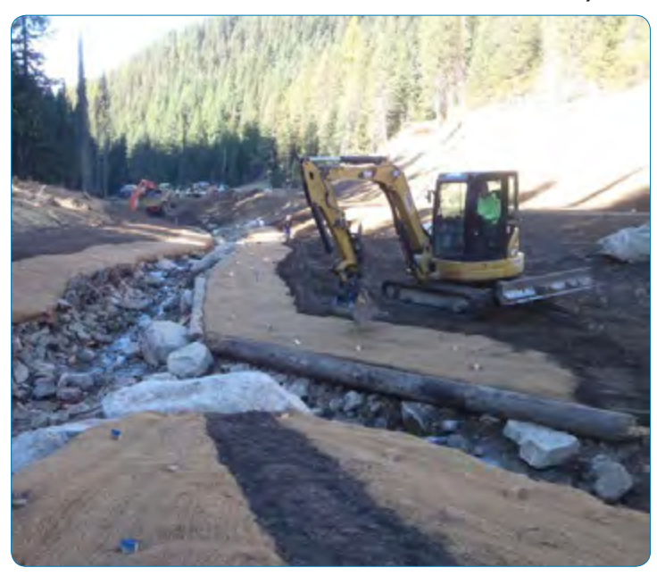
Crews constructing a new stable channel in the cleaned up area.

Good things have been happening this year up in the Ninemile watershed. Crews have reconstructed over 1700 linear feet of east fork Ninemile Creek and 1300 linear feet of tributaries around the Interstate Callahan Rock Dumps. The creek was rerouted during work to allow removal of contaminants from the waste rock dumps and the streambed. When the removal was done, a new stream channel was created. Now the water flows through clean habitat for fish and other animals, freshly planted with new vegetation. This year, about 43,000 cubic yards of mine waste was removed, bringing the area total to over 200,000 cubic yards in two years. The waste was placed in the Waste Consolidation Area, or WCA. Work will continue in east fork Ninemile Creek next year as crews begin cleanup at the Success Complex.