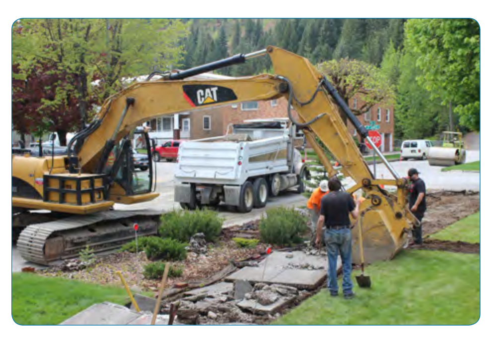
Road crews can be good neighbors, too!

All of this was happening as IDEQ-contracted road crews from Kingston-based DG&S were starting to do the final work of the new pavement. When two men from the project walked over to the volunteers and questioned what they were doing, there was concern that the volunteers would be told the sidewalk project would have to stop because it could interfere with the road work.