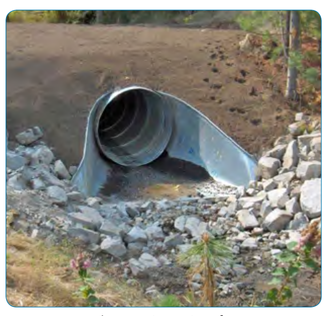
Remedy protection projects focus on reducing recontamination.

http://yosemite.epa.gov/r10/cleanup.nsf/sites/bh or view it at select local libraries.