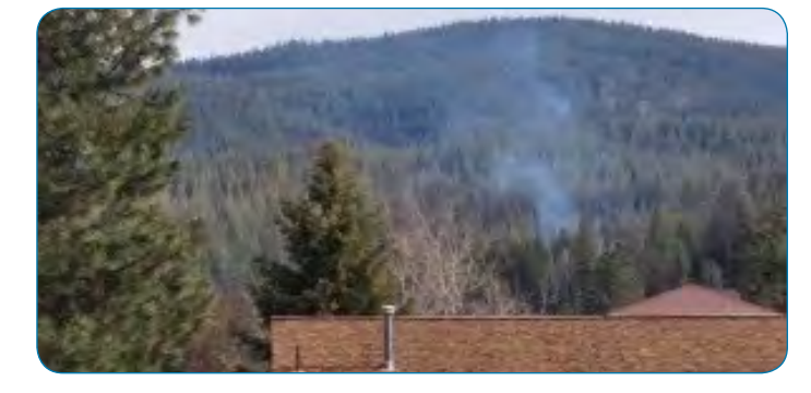
An EPA grant to IDEQ will help the West Silver Valley breathe cleaner air.