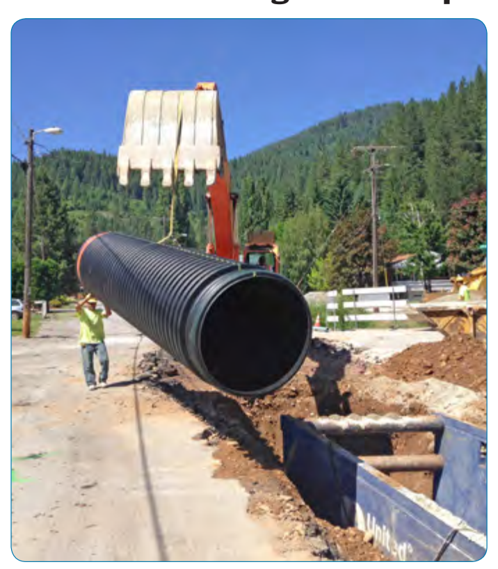
Revenue Gulch in Silverton was one of many remedy protection projects this year.

You probably noticed lots of construction this summer and fall in the Silver Valley. It was a big year for remedy protection work. This work helps protect public health by keeping cleaned up areas clean – by controlling flooding and drainage in select areas. IDEQ completed four projects: Little Pine Creek improvements, Jackass Creek bypass pipe (protecting the hospital), a culvert upgrade on Silver Creek in the Page area, and overland water diversion on the gravel road above Wardner. All remedy protection work is now complete in the Box.