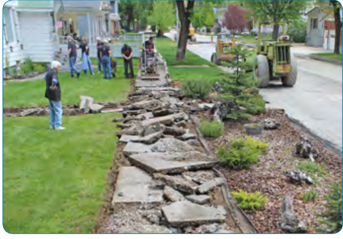
Volunteers planned to break up 129 feet of concrete and load it into wheelbarrows.

Finally, more than a dozen volunteers gathered with plans to break up 129 feet of concrete, load it into wheelbarrows, and take it around the corner where the City of Wallace agreed to pick it up.