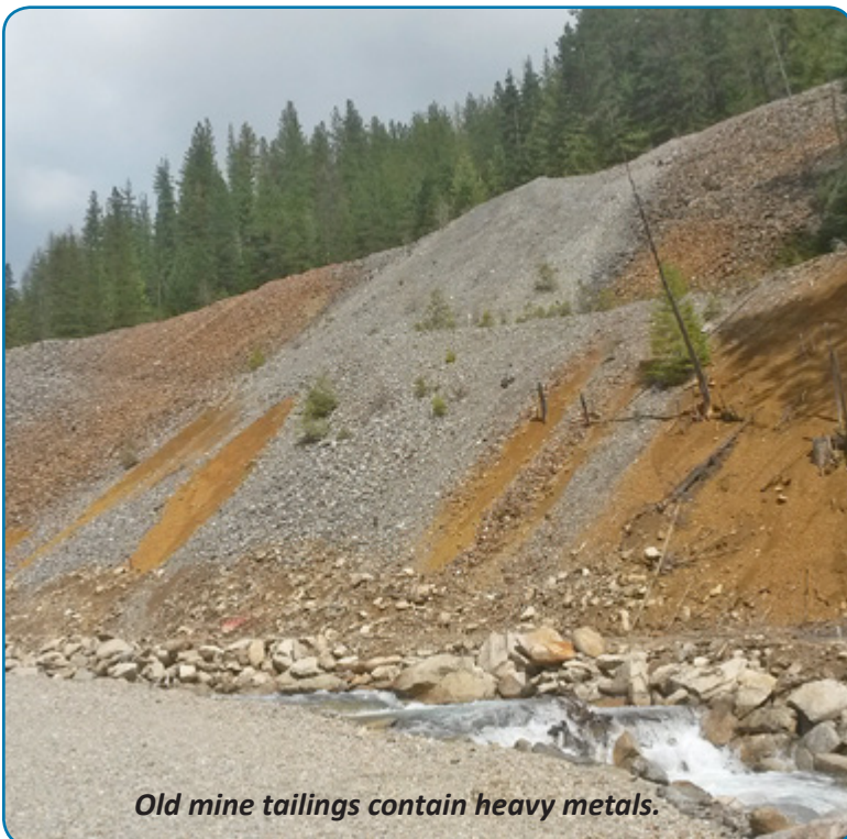
Old mine tailings contain heavy metals.