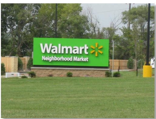
Figure 5. Entrance to the La Plaza Argentine Wal-Mart Neighborhood Market.

conditions necessary to mitigate the environmental liability concerns associated with a property. <sup>4</sup> It addresses landowners' environmental liability concerns, while helping to maintain site remedies and ensuring long-term protectiveness. With EPA's approval, KDHE agreed to work with current and future site owners to ensure the remedy's continued protectiveness.