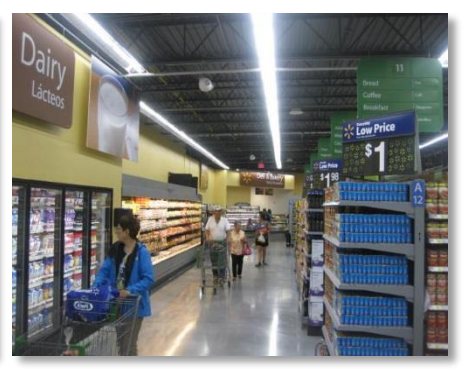
Figure 6. Shoppers enjoying the new amenities offered by the Wal-Mart Neighborhood Market.