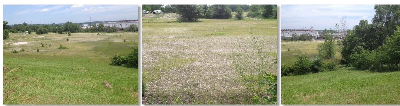
Figure 4. Views of the Kansas City Structural Steel site prior to redevelopment.

To make sure community needs and priorities were at the forefront of development considerations, El Centro worked with the Argentine Neighborhood Development Association (ANDA). ANDA is a non-profit corporation with a mission to