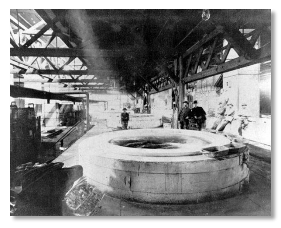
Figure 2. Operations at the Argentine Smelter in 1899.

The 22-acre site is located in the Argentine community in Kansas City, Kansas (Figure 1), just southwest of the Kansas River. Metropolitan Avenue borders the site to the south and commercial properties border the site to the east. The northern border includes the Burlington Northern Santa Fe Railway. Residences border the western edge of the site. According to 2014 Census data estimates, about 161,636 people live in Wyandotte County.<sup>1</sup>