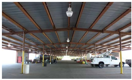
Figure 8: Street Department storage shed