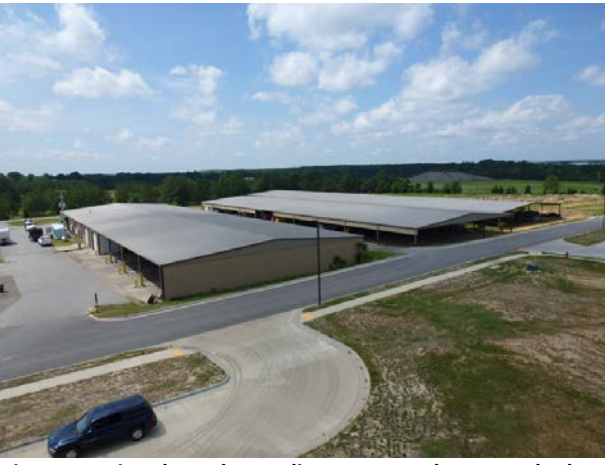
Figure 4: Drive-through recycling center and storage sheds