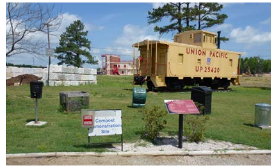
Figure 7: The interactive recycling education park

Captain Kenny Boyd, Police Patrol Division