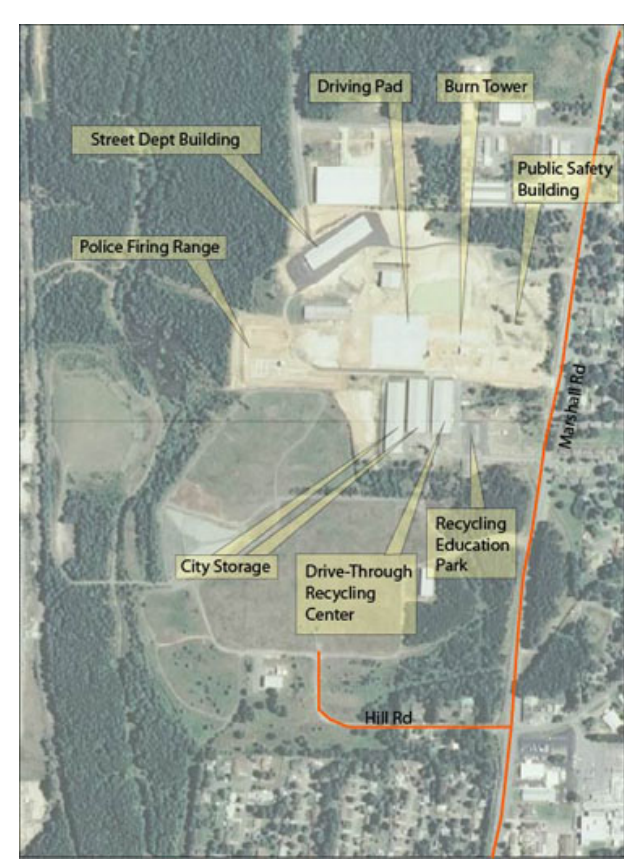
Figure 3: Map highlighting site reuses

Throughout the site's cleanup, EPA staff met regularly with state and city officials to share information and to