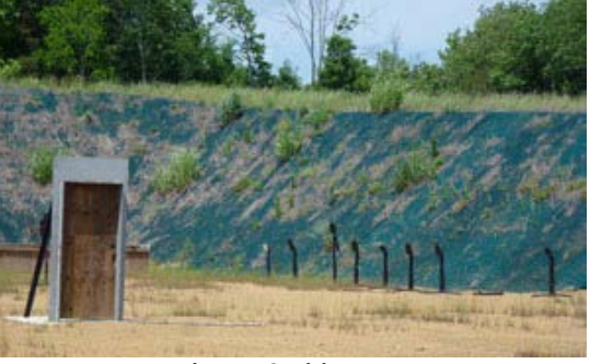
Figure 10: Firing range