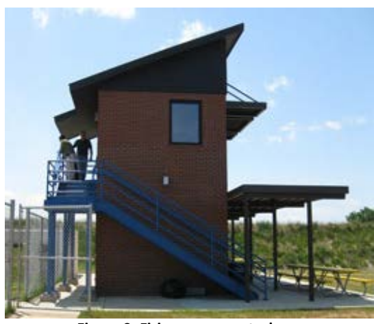
Figure 9: Firing range control room