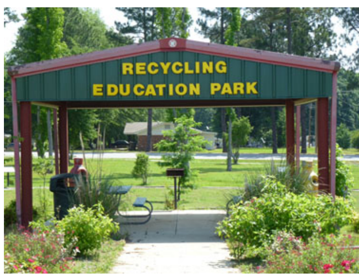
Figure 1: Jacksonville's Recycling Education Park pavilion at the Vertac, Inc. Superfund site

In Jacksonville, Arkansas, the community and EPA have come together in a remarkable partnership that has led to the cleanup and successful reuse of the Vertac, Inc. Superfund site. Working together, parties developed a remedy that protected human health and the environment and enabled the reuse of this former chemical manufacturing facility. The City of Jacksonville recognized that the 193acre site could provide space to address multiple local government priorities, including the need for a new recycling center, a fire department training facility, a driver training pad, a police firing range, new space for the Jacksonville Street Department, a recycling education park, a picnic area, and a police station. EPA worked with the community to ensure the compatibility of the site's remedy with these land uses.