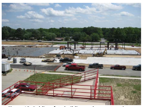
Figure 13: Public safety building under construction

Funding for this project came from a variety of sources. A one-time city sales tax increase generated $4 million. FEMA awarded the city a $600,000 grant to build the community safe room. A grant awarded by the local hardware store to the Jacksonville Citizen's Police Academy Alumni funded the kitchen in the new facility.