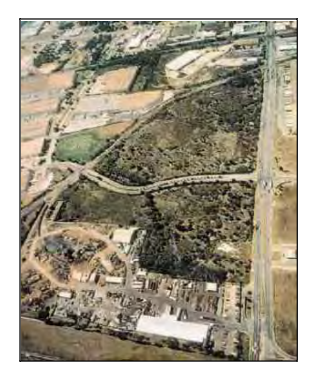
Exhibit 4. Aerial View of Subareas 2, 3, and 4