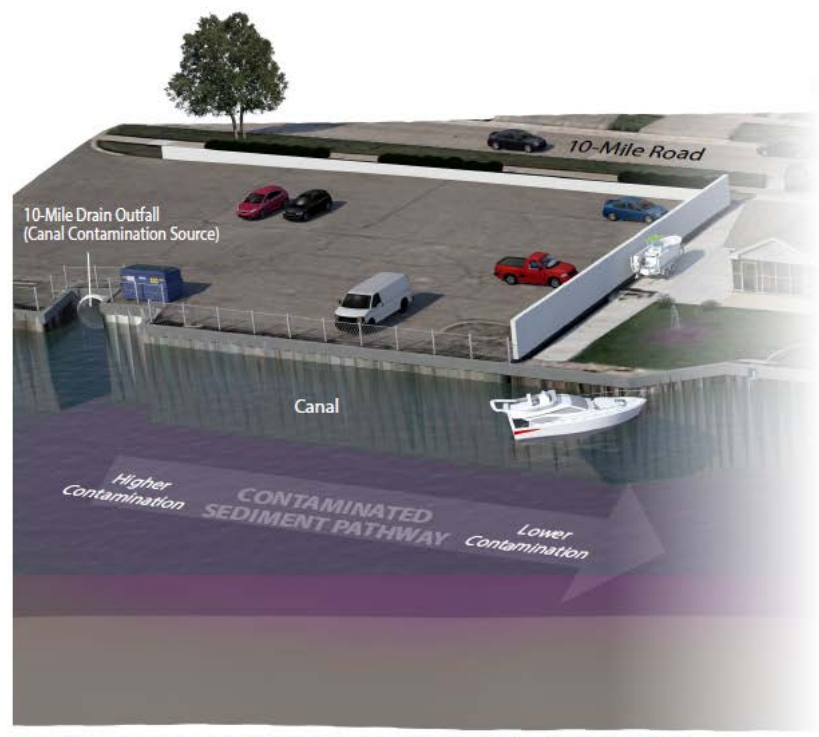
Note: This is a contaminant pathway model only and is not intended to represent actual conditions at specific property locations

These illustrations show the various routes the PCB contamination took to infiltrate the Ten-Mile Drain Superfund site. Investigators believe it all started many years ago when PCB-contaminated oil was dumped or used for dust control on a formerly unpaved parking lot seen in the top right-hand corner of the first illustration.