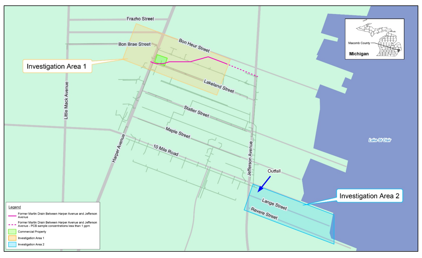
The latest proposed EPA cleanup project for near-surface soil in the Ten-Mile Drain site involves properties and utility corridors in Investigation Areas 1 and 2. Under the proposed cleanup plan, EPA will remove soil contaminated with elevated levels of PCBs.