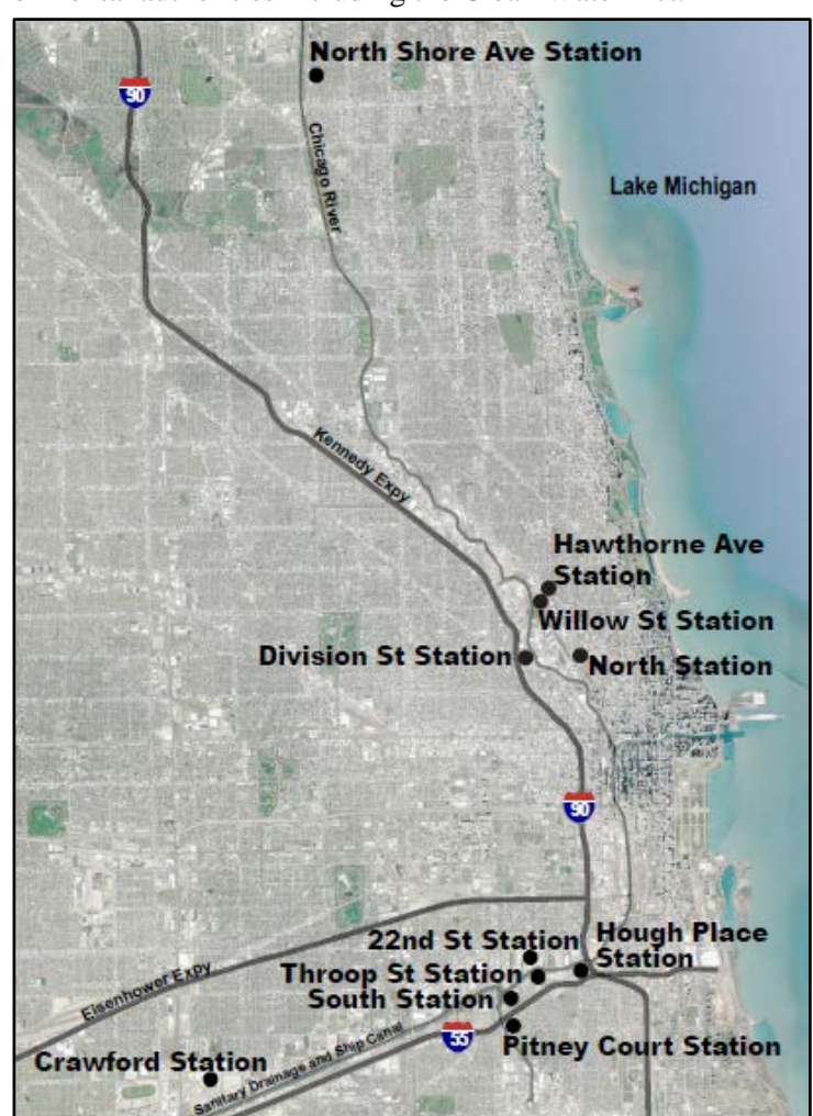
Map showing the 11 MGP sites along the Chicago River.

Bubbly Creek had been part of the South Branch River Operable Unit of the MGP sites and it is now removed from the Superfund program also. Any work being done to improve water quality will be managed under other environmental authorities including the Clean Water Act.