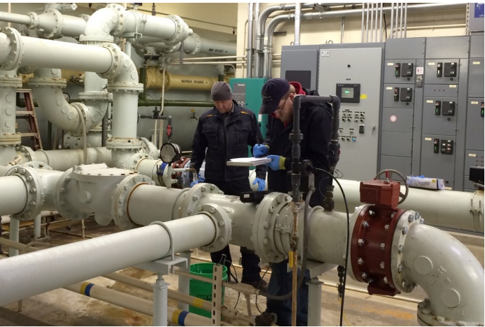
Drinking water treatment plant.

What is the difference between a drinking water well and a source control well? Drinking water wells that are part of the Reilly cleanup pump large volumes of water that is treated before use. Pumping these wells also helps control the movement of contaminated groundwater. St. Louis Park drinking water wells are identified by the letters “SLP.” Source control wells are used to pump and treat groundwater and control the spread of the contamination and can be identified by the letter “W” before the number. Water from source control wells is treated and discharged into either the sanitary sewer or into Minnehaha Creek.