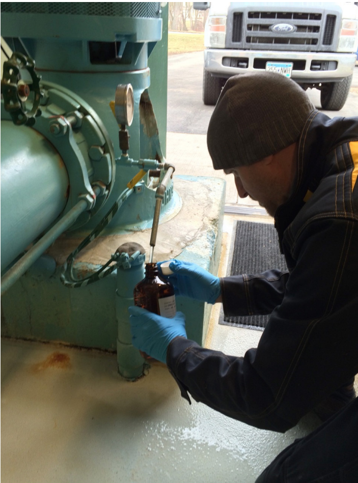
A city contractor takes a sample from an area drinking water well.

The city of St. Louis Park regularly takes water quality samples from a large network of groundwater monitoring wells. EPA, MPCA and MDH oversee the city’s groundwater monitoring and ensure that the treatment remains effective.