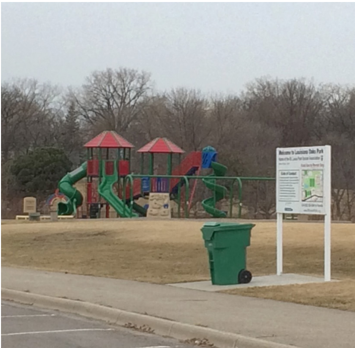
A playground on the former site.

Redeveloping the formerly contaminated property was important to the city’s growth as a Minneapolis suburb, primarily because St. Louis Park has little land available for new construction other than previously used property. Ultimately, a strong commitment to redevelopment and the local government’s willingness to invest in a contaminated property were key factors to overcoming impediments to reuse. Now the area has condominiums and townhouses, a restaurant and bowling alley, an office building and a recreational park with athletic fields, walking paths, a recreation center, a pond, a playground and a parking lot.