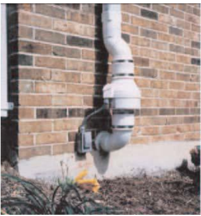
An example of a system that draws radon and other vapors out of the soil and vents them outside. It's known as a "sub-slab mitigation system."

EPA does not generally recommend indoor air sampling before sub-slab sampling because indoor air quality varies widely day to day. Also, household products may interfere with sampling results.