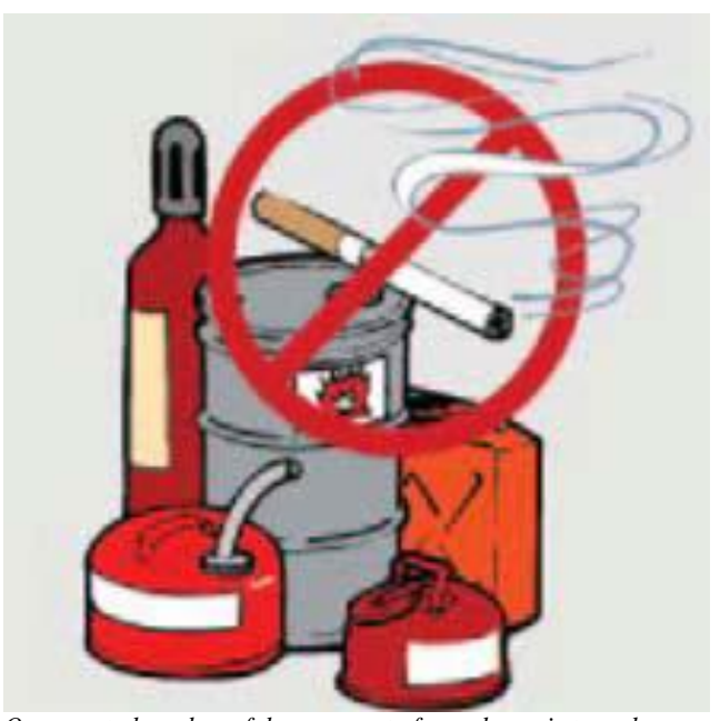
One way to keep harmful vapors out of your home is to make sure common household products, especially chemical- and petroleum-based products, are tightly sealed and properly stored in a well-ventilated area.

The results of these samples will tell EPA if indoor air samples are needed. The indoor air samples will tell us if there are vapors in the indoor air. The samples will also show if the vapors pose a health risk, or if they are at levels normally present in most buildings.