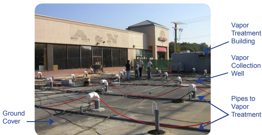
ERH system cleans up contaminated soil and groundwater.

In situ thermal treatment methods speed the cleanup of many types of chemicals, and are among the few in situ methods that can clean up NAPLs. Thermal treatment can be used in silty or clayey soil where other cleanup methods do not perform well. They also can reach contamination deep underground or beneath buildings, which would otherwise be difficult or costly to dig up to treat above ground. In situ thermal treatment has been selected or is being used in cleanups of at least 12 Superfund sites as well as dozens of other sites across the country.