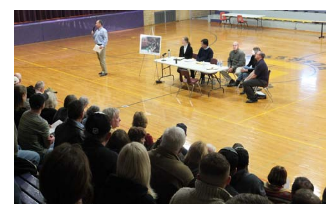
EPA assembled a panel of experts to speak to residents at the April 3, 2013 meeting.

From April 3 - 5, 2013, EPA conducted community interviews with area residents and officials to use in developing this CIP.