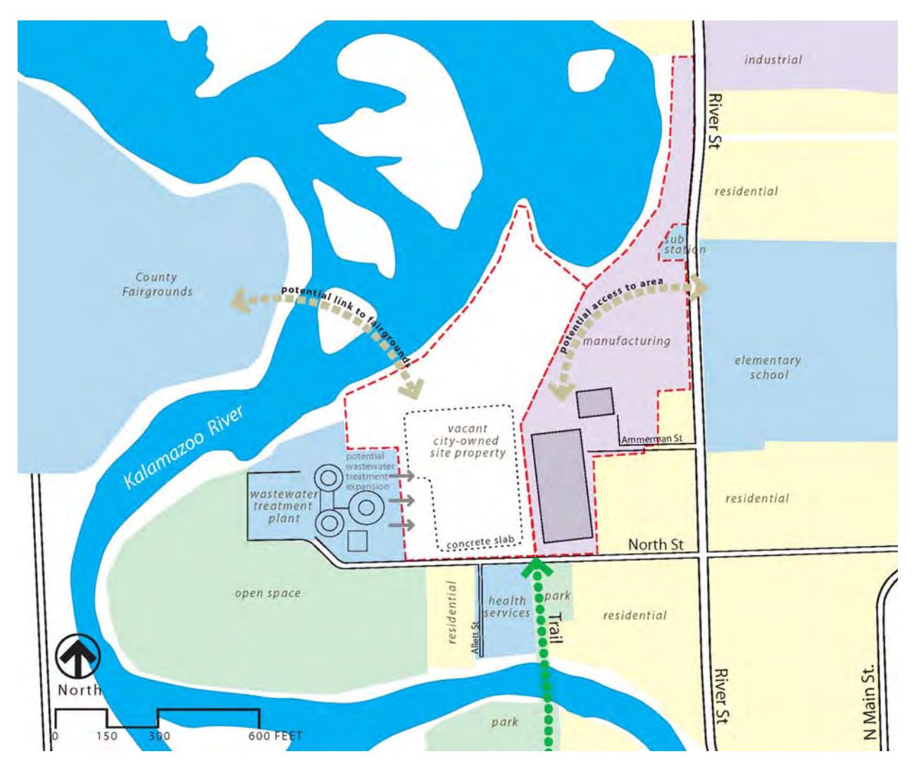
Figure 3. Future Land Use Considerations