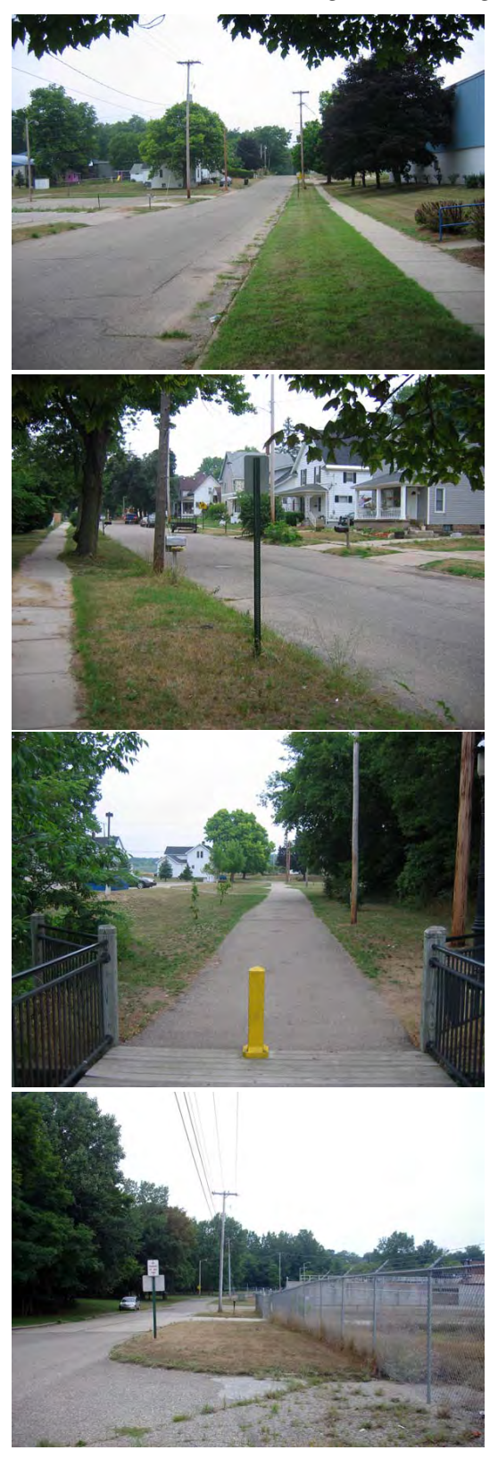
G. Site and Surrounding Area Photographs

View west along North Street towards the Rockwell site and the city's wastewater treatment plant.