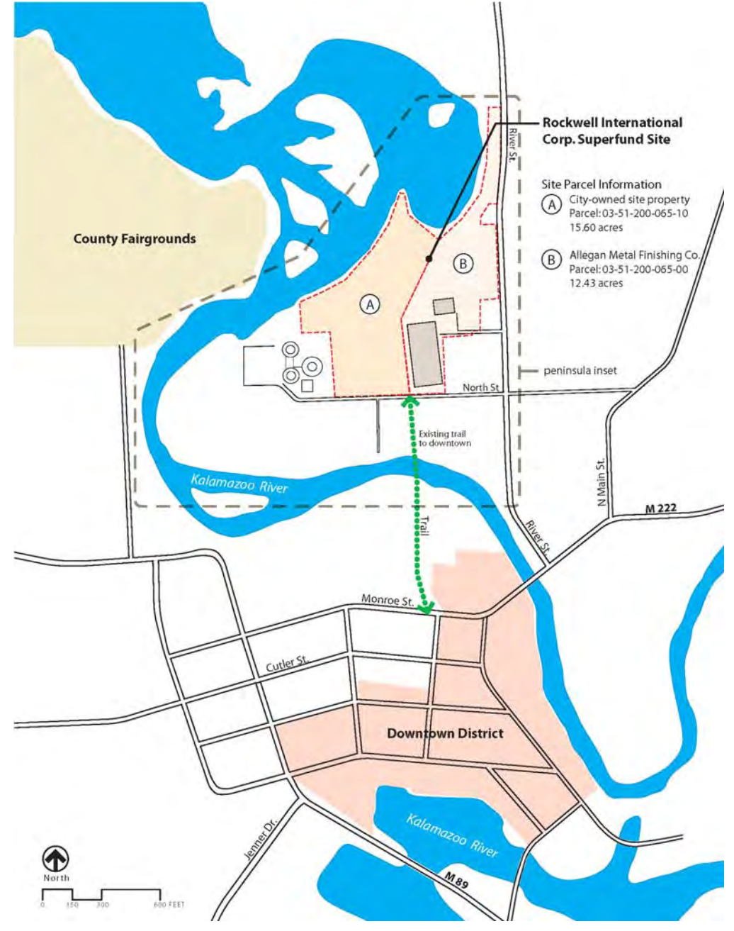
Figure 1. Site Location Map