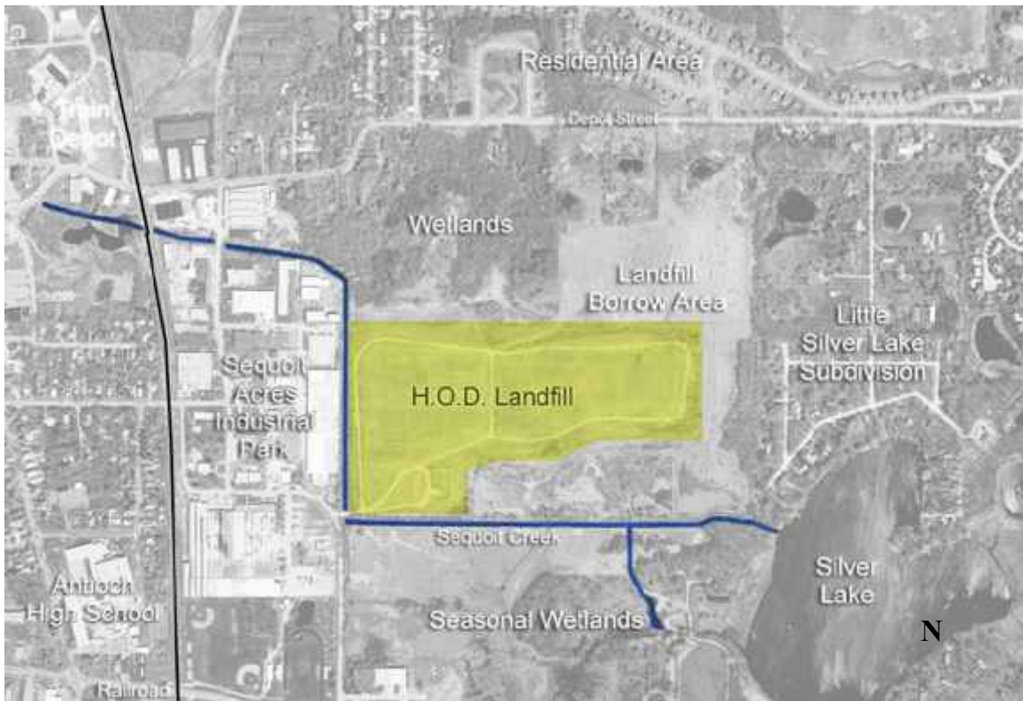
Exhibit 2. H.O.D. Landfill Aerial Photograph Showing Land Uses

The southwest corner of the Site lies 150 feet east of McMillen Road, at the point where northbound McMillen Road changes direction from north/south to east/west. The Site's western boundary continues north for 1,500 feet, where it turns east and extends for 600 feet. The Site boundary heads southeast for 100 feet, and continues to extend east again for another 1,500 feet. The boundary then stretches south for 700 feet. The Site boundary then extends west for 600 feet, at the end of which it begins to curve to the south and west at a ratio of about 100 feet south for every 400 feet west. The boundary then again heads directly west for 400 feet, then turns southwest for 150 feet, followed by a run of 350 feet to the south. The boundary then extends 650 feet to the west and 100 feet to the northwest to return to its original position. Depot Street runs parallel to the Site's northern border 1,200 feet north of the Site. To the east, Lakeview Drive runs parallel to the Site's eastern border 600 feet away. A seasonal wetland begins 250 feet to the southeast of the Site's southeastern border.