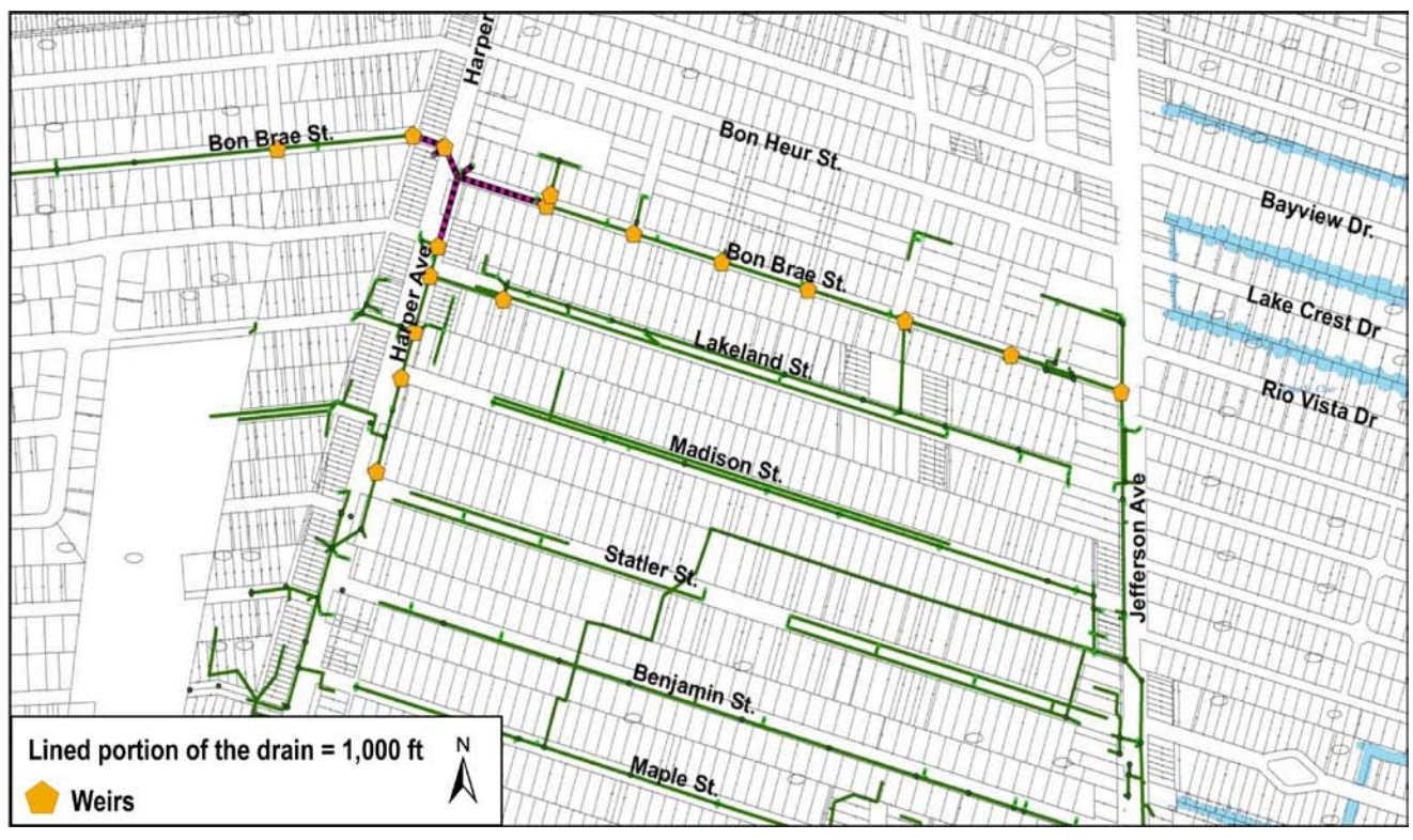
Figure 3 Location of weirs in the Ten-Mile Drain Storm Water System