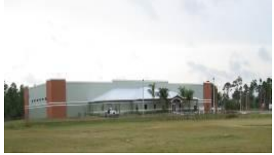
Figure 5. The Stuart Web Inc. facility on Lot 3

The site's cleanup has benefited the parties involved, the surrounding community, the local economy and the environment. EPA and PSIP worked together to integrate cost-saving maintenance activities into site redevelopment plans. PSIP divided the industrial park into lots according to the locations of EPA's ground water monitoring wells, which allows EPA easy access to the wells. The industrial park now provides seven lots of industrially zoned, utility-connected property ranging in size from 1 acre to 5.5 acres. Other park features include wetland areas, a retention pond and a paved road. In total, the industrial park offers 150,000 square feet of warehouse, office and industrial space.