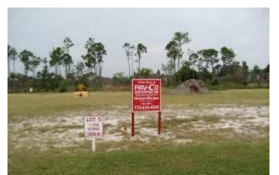
Figure 6. Construction underway on Lot 5, owned by CKO of Martin County

In 2008, CKO of Martin County, a street and highway paving contractor then known as Pav-Co Contracting, purchased Lot 5 at the industrial park. Martin County approved the company's plans for construction of a 1,045-square-foot office and a 5,260-square-foot warehouse on the 2-acre lot in 2009. Construction of the facilities is underway, with completion anticipated by 2014.<sup>3</sup>