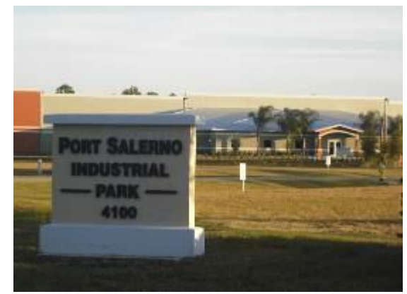
Figure 1. Entrance to Port Salerno Industrial Park

The Solitron Microwave property in Port Salerno, Florida was once a productive manufacturing facility. Following its closure, it became a community eyesore. Contamination also posed a threat to public health and the environment. EPA and local stakeholders worked together to enable the site's cleanup and reuse. Today, the Solitron Microwave Superfund site is home to Port Salerno Industrial Park, providing 20 acres of commercial and industrial space to various tenants. Redevelopment of the site has increased the site's land value $2 million since 2003 to a total of $2.3 million in 2011. This case study explores the site's cleanup and reuse, illustrating the opportunities, benefits and impacts of Superfund redevelopment in action.