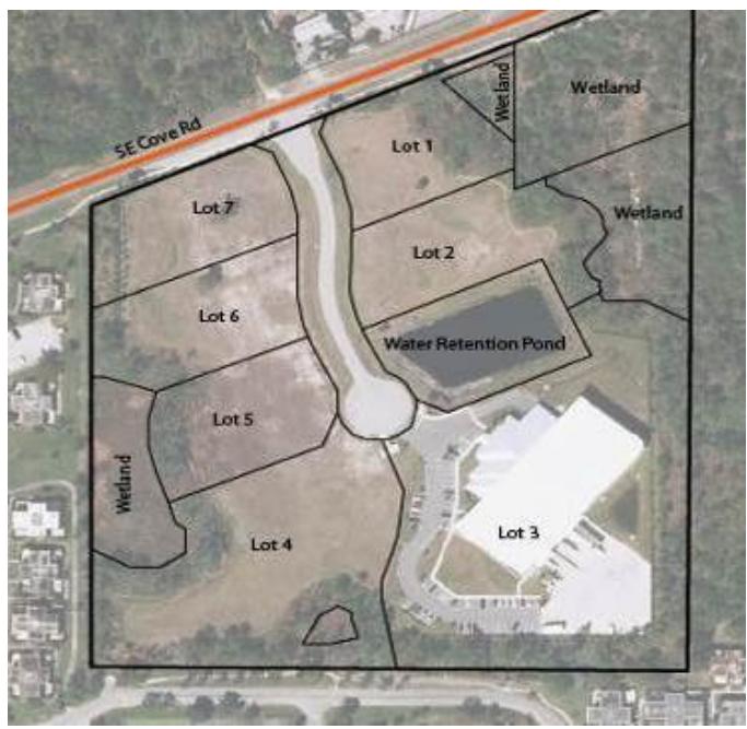
Figure 3. Port Salerno Industrial Park

Solvent use and waste disposal practices contaminated soil, sediment and ground water. In the early 1980s, the Florida Department of Environmental Protection (FDEP) identified soil contamination at the site. From 1991 until 1998, Martin County Health Department sampling found contamination in 12 private wells near the site. EPA investigations confirmed contamination. Volatile organic compounds (VOCs) were the primary contaminants of concern. In 1998, EPA placed the site on the Superfund National Priorities List.<sup>2</sup>