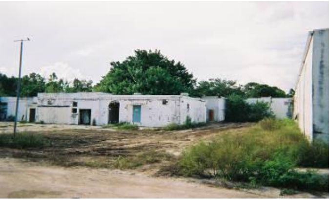
Figure 4. Overgrown and abandoned Solitron Microwave Company facilities prior to cleanup in 2000