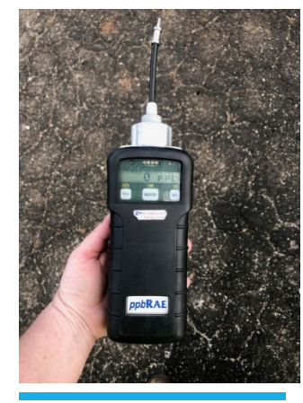
Above: Hand-held vapor meter.